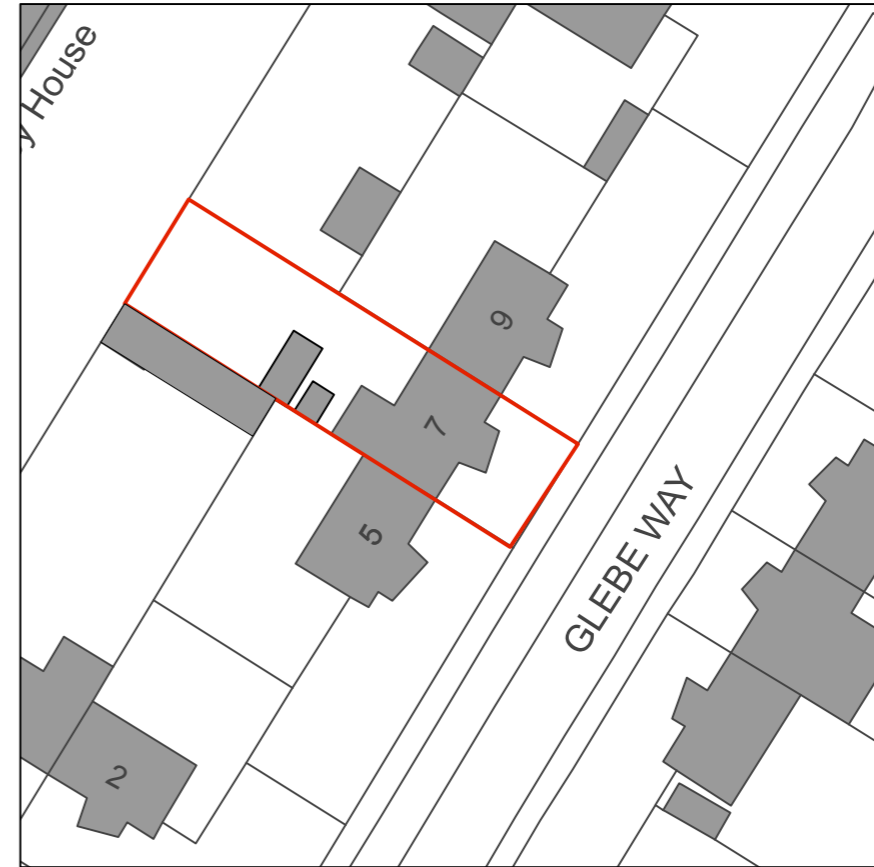
EXISTING BLOCK PLAN Scale 1:500