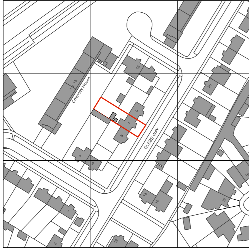
EXISTING LOCATION PLAN Scale 1:1250