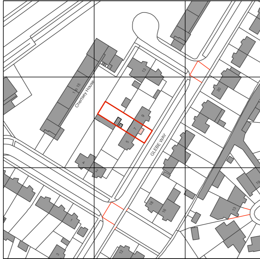
PROPOSED LOCATION PLAN Scale 1:1250