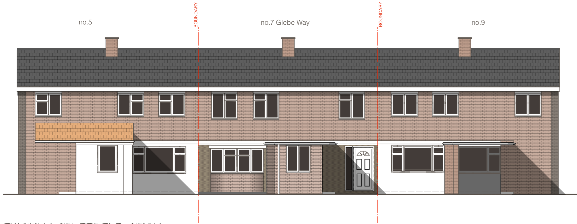
EXISTING STREET ELEVATION