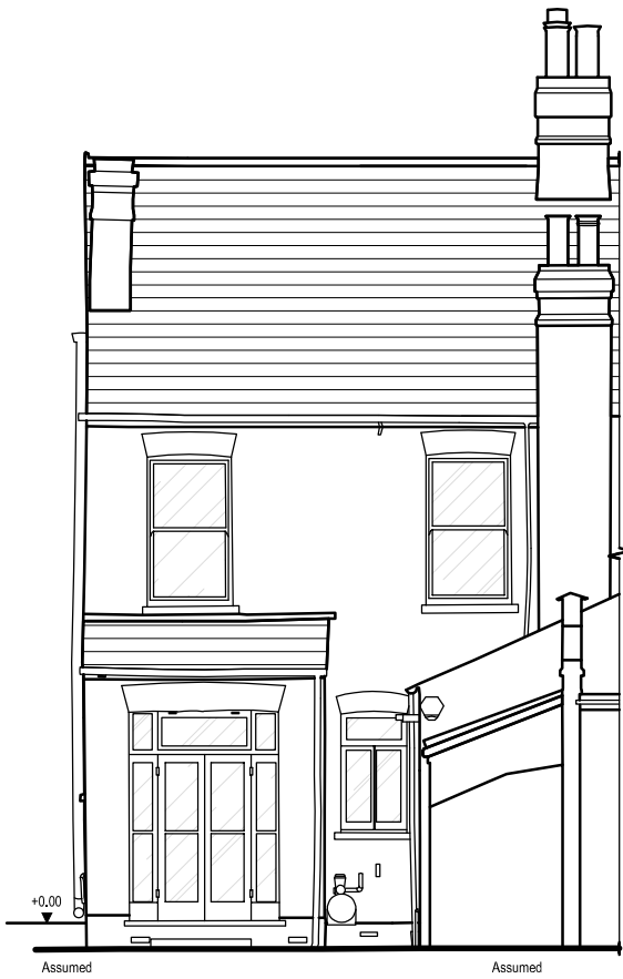
Rear Elevation - Existing