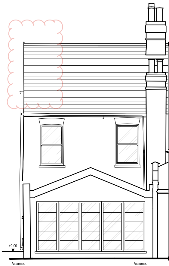
Rear Elevation - Proposed