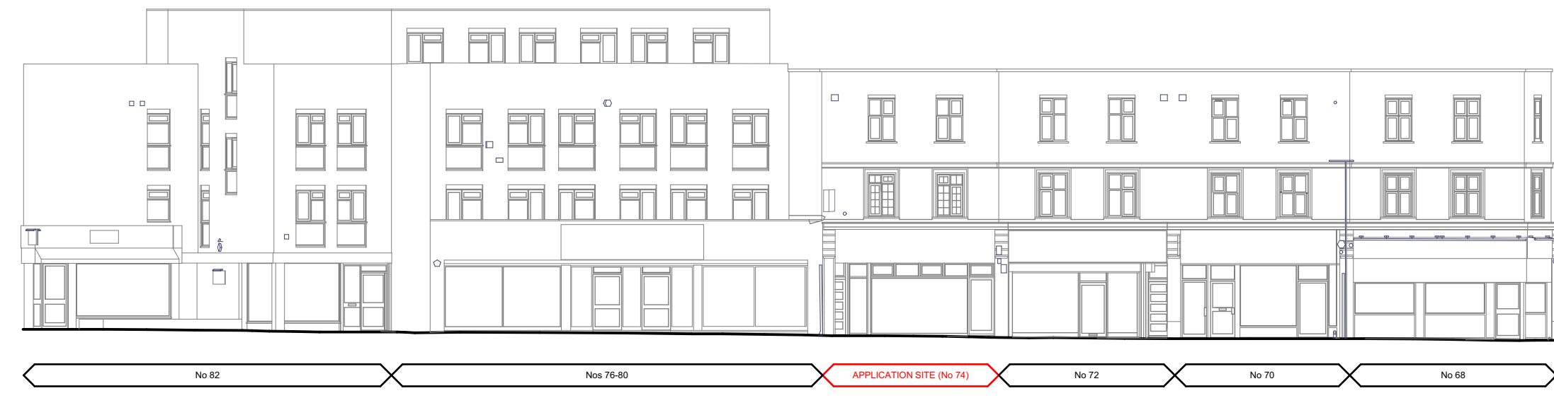
02 - Street Elevation SCALE: 1:200@A1