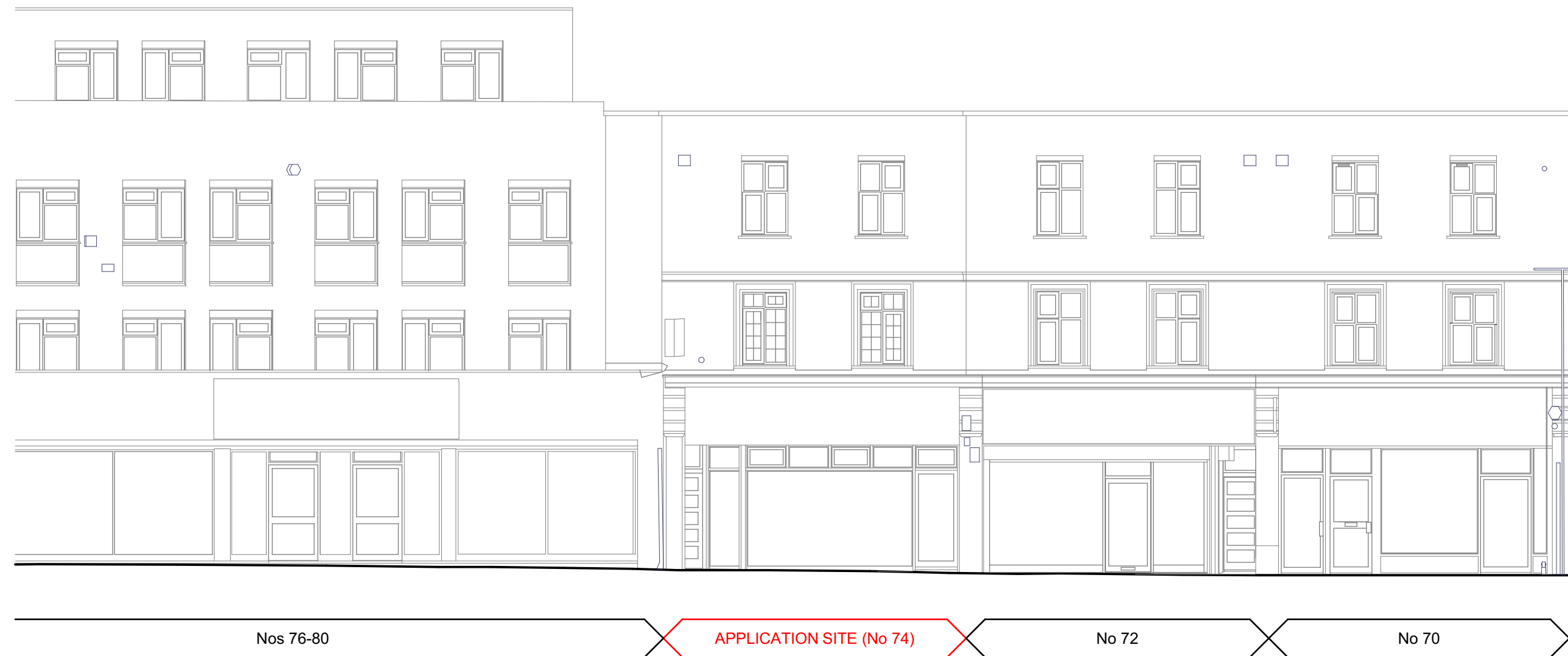
01 - Front Elevation SCALE: 1:100@A1