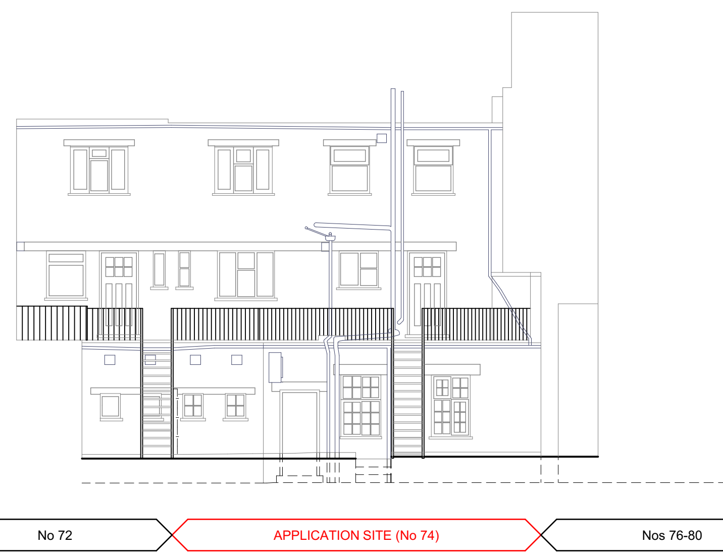
03 - Rear Elevation SCALE: 1:100@A1