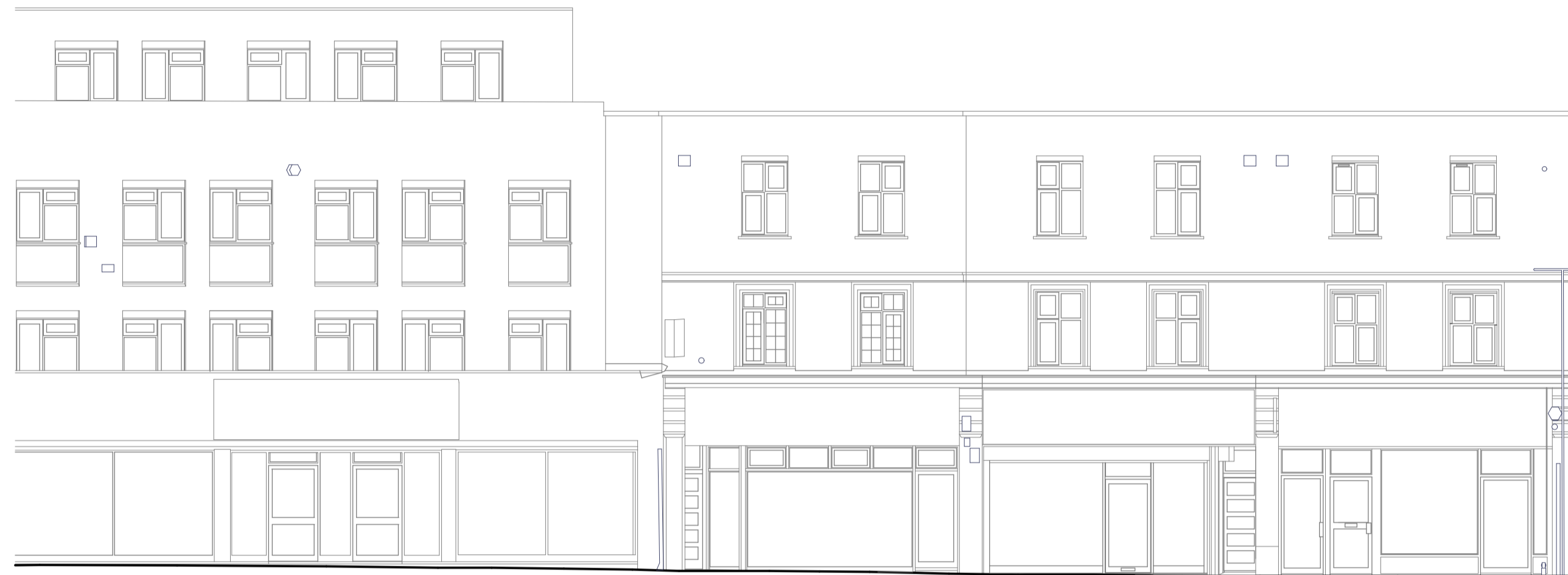
01 - Front Elevation SCALE: 1:100@A1