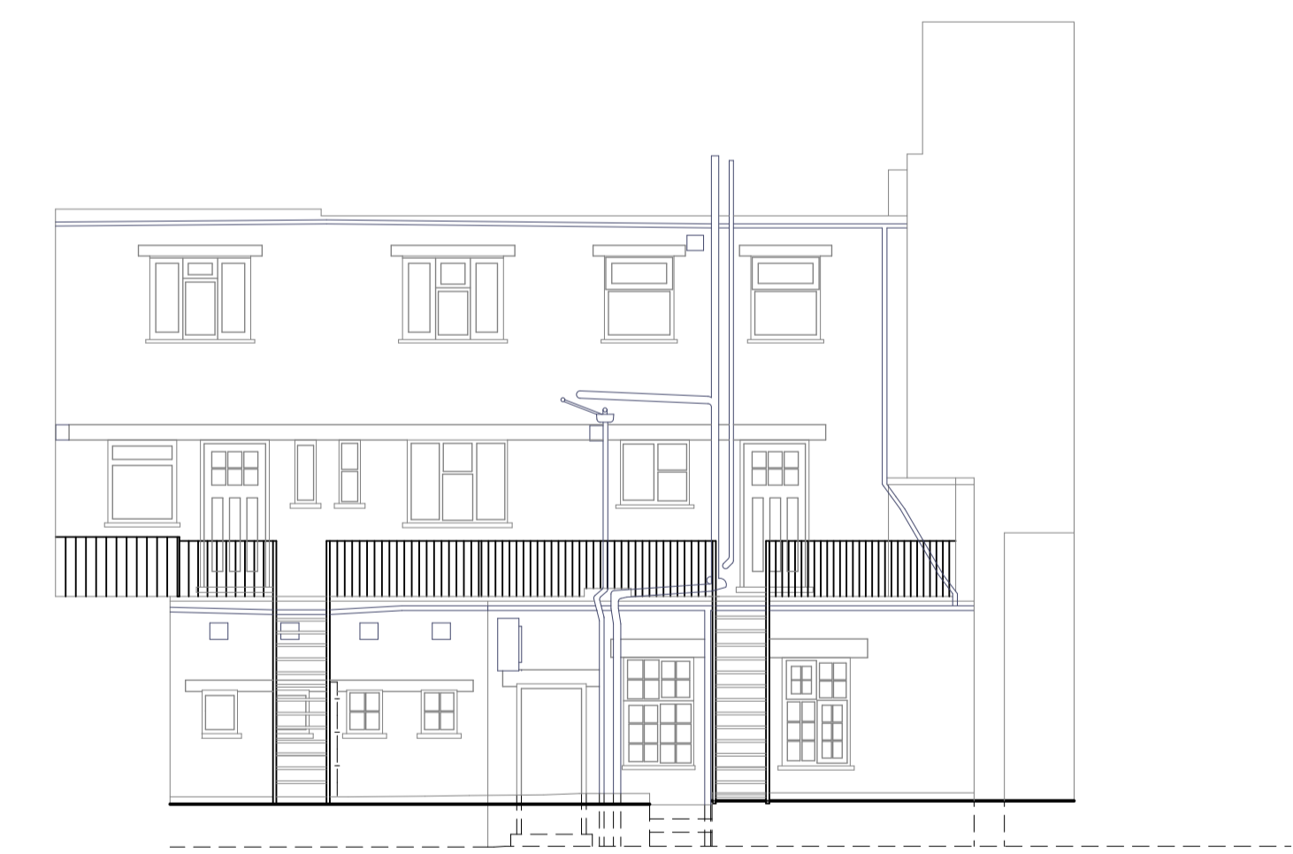
03 - Rear Elevation SCALE: 1:100@A1