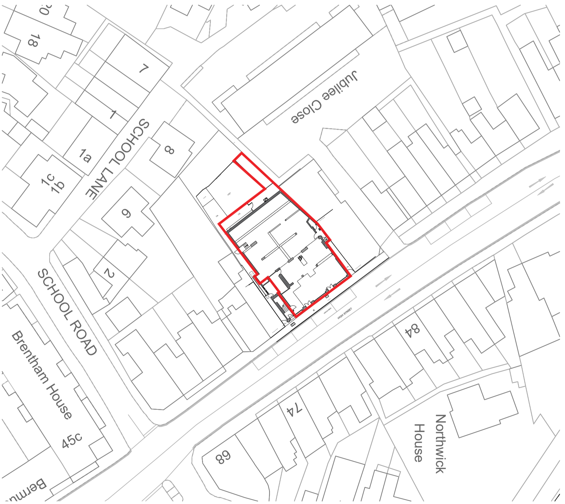
02 BLOCK PLAN P191099.100 1:500