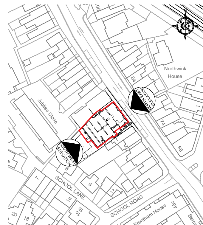
03 GROUND FLOOR KEY PLAN 118165 211 NTS