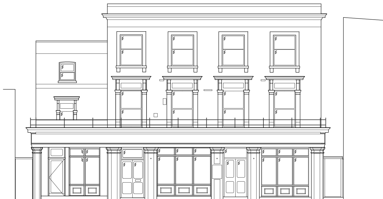
01 EXISTING NORTH EAST ELEVATION 118165 211 1:100@A3