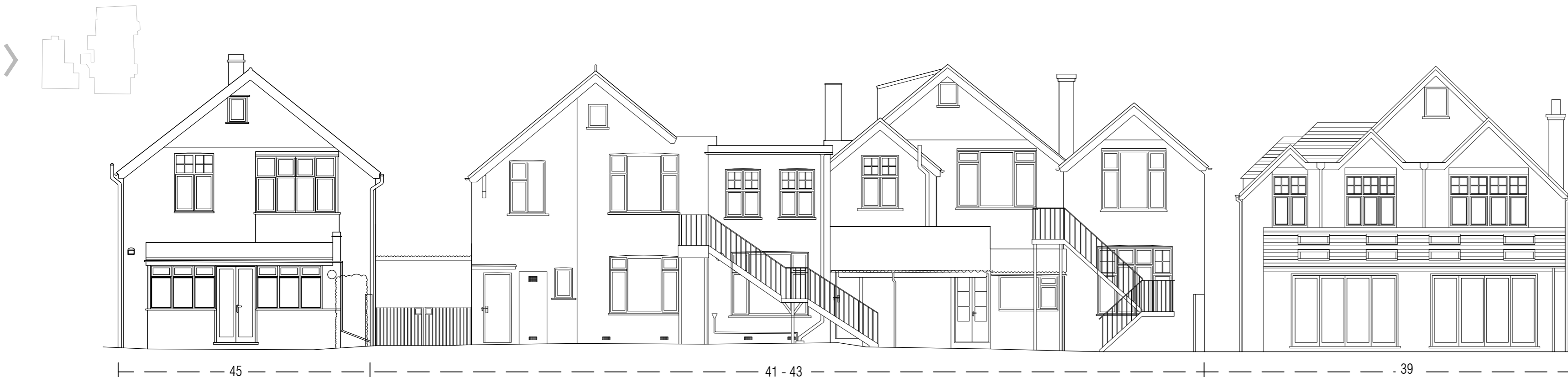
REAR ELEVATION IN FRONT OF KINDERGARTEN BUILDING (WEST)