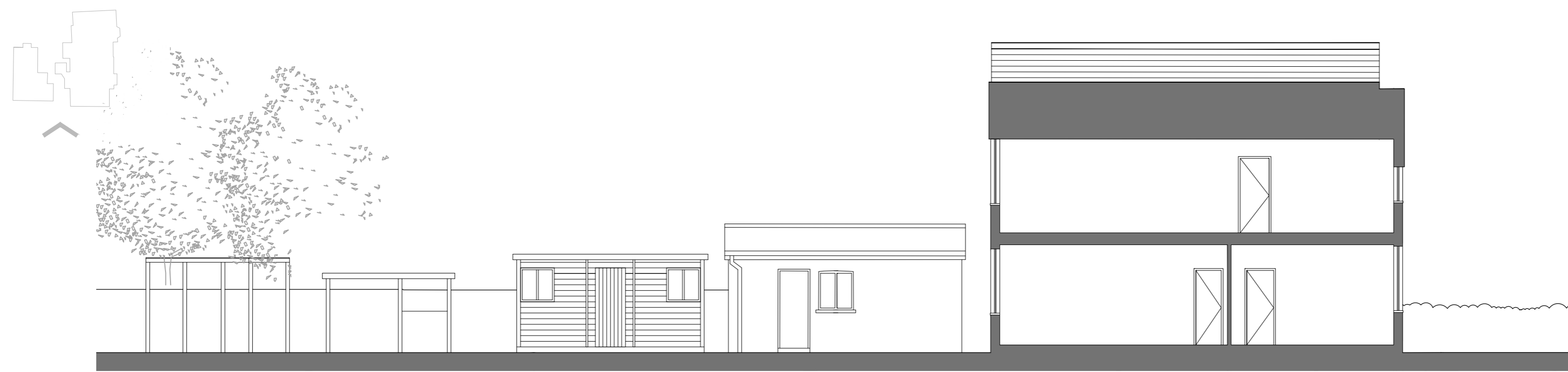
SIDE ELEVATION IN FRONT OF KINDERGARTEN BUILDING (SOUTH) - GARAGE