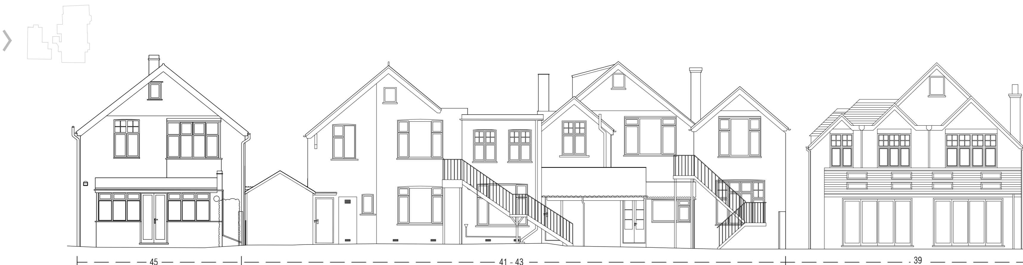
REAR ELEVATION IN FRONT OF KINDERGARTEN BUILDING (WEST) - GARAGE