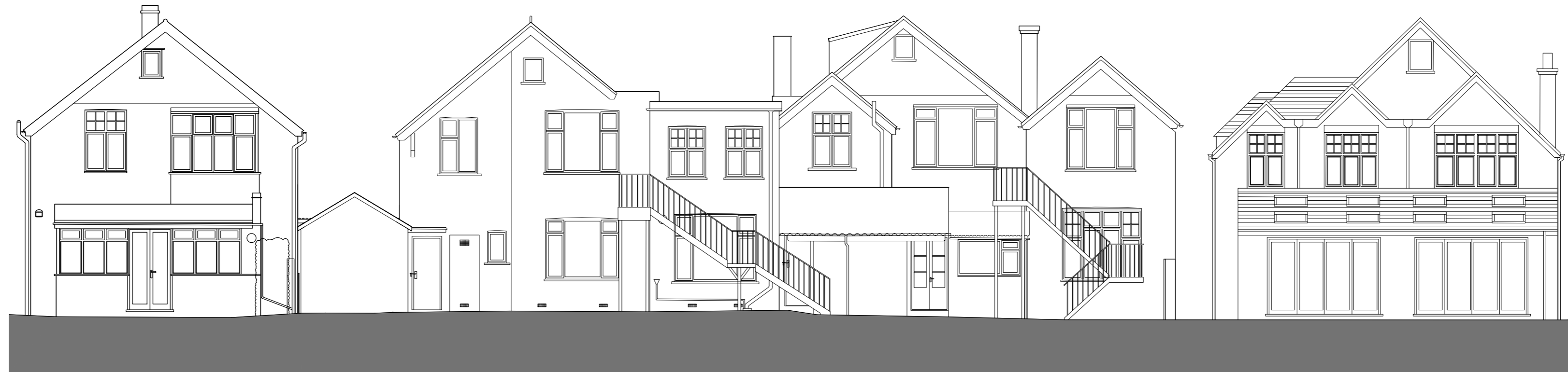
EXISTING SITE SECTION C