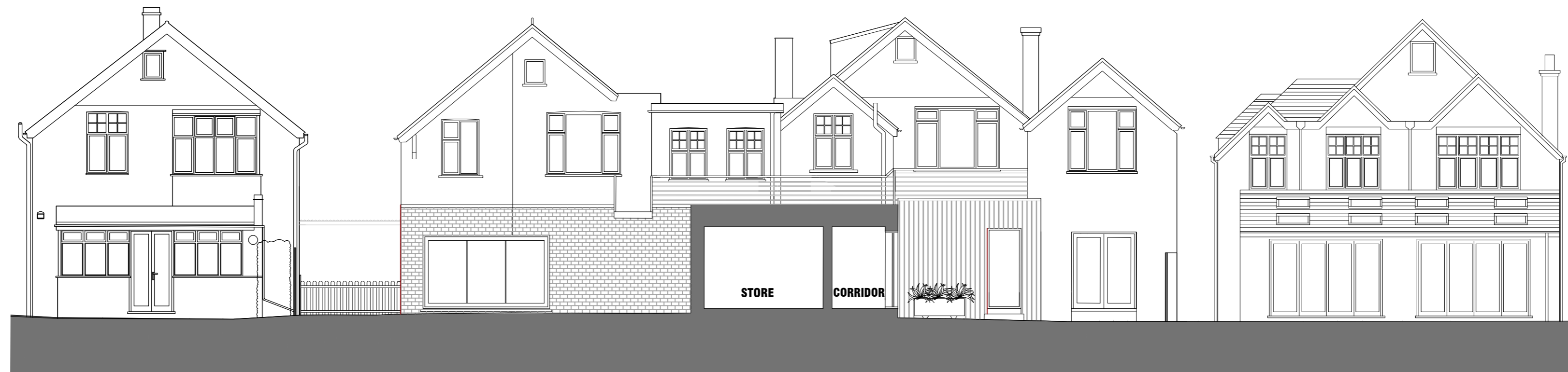
PROPOSED SITE SECTION C