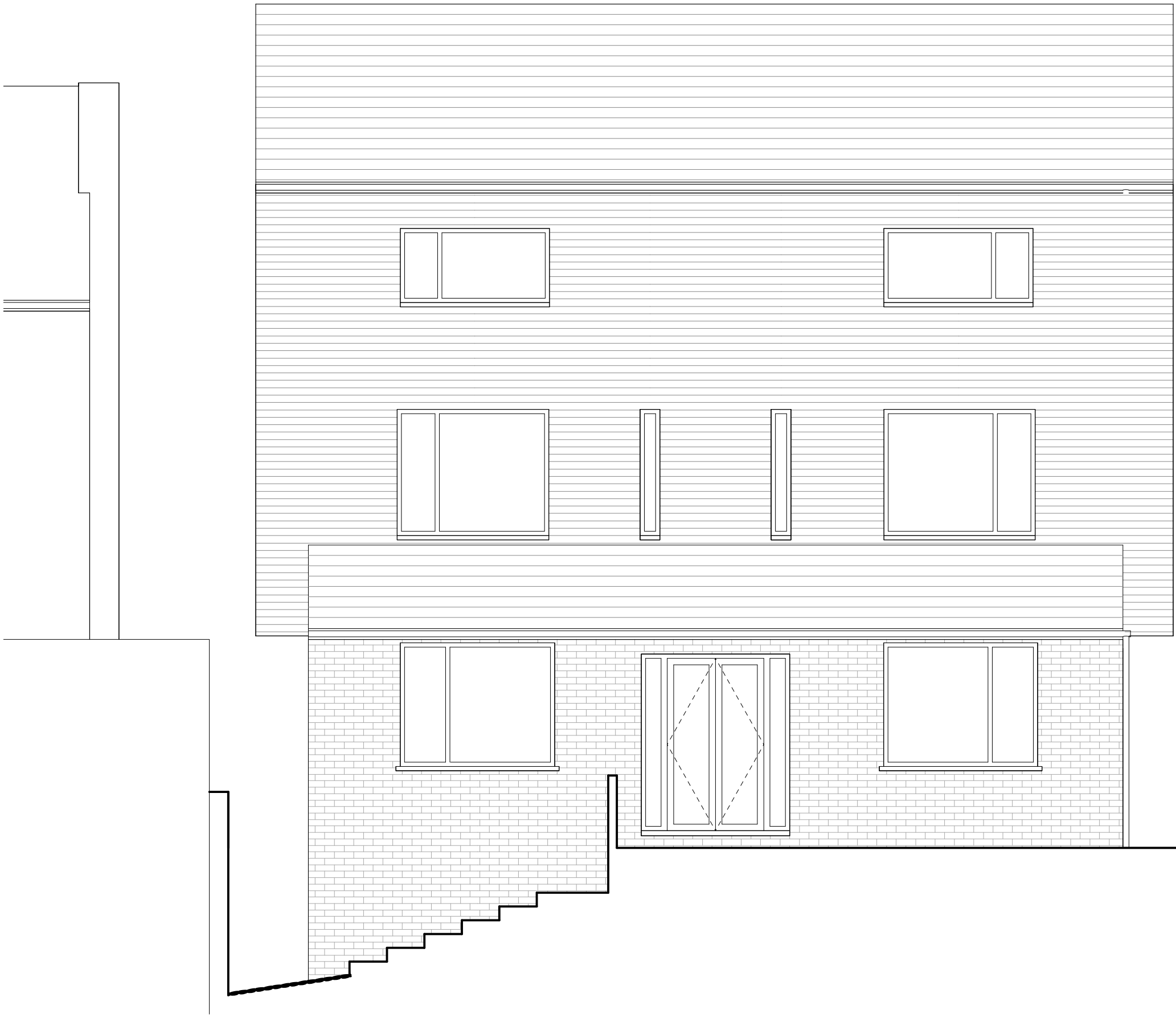
EXISTING: REAR ELEVATION