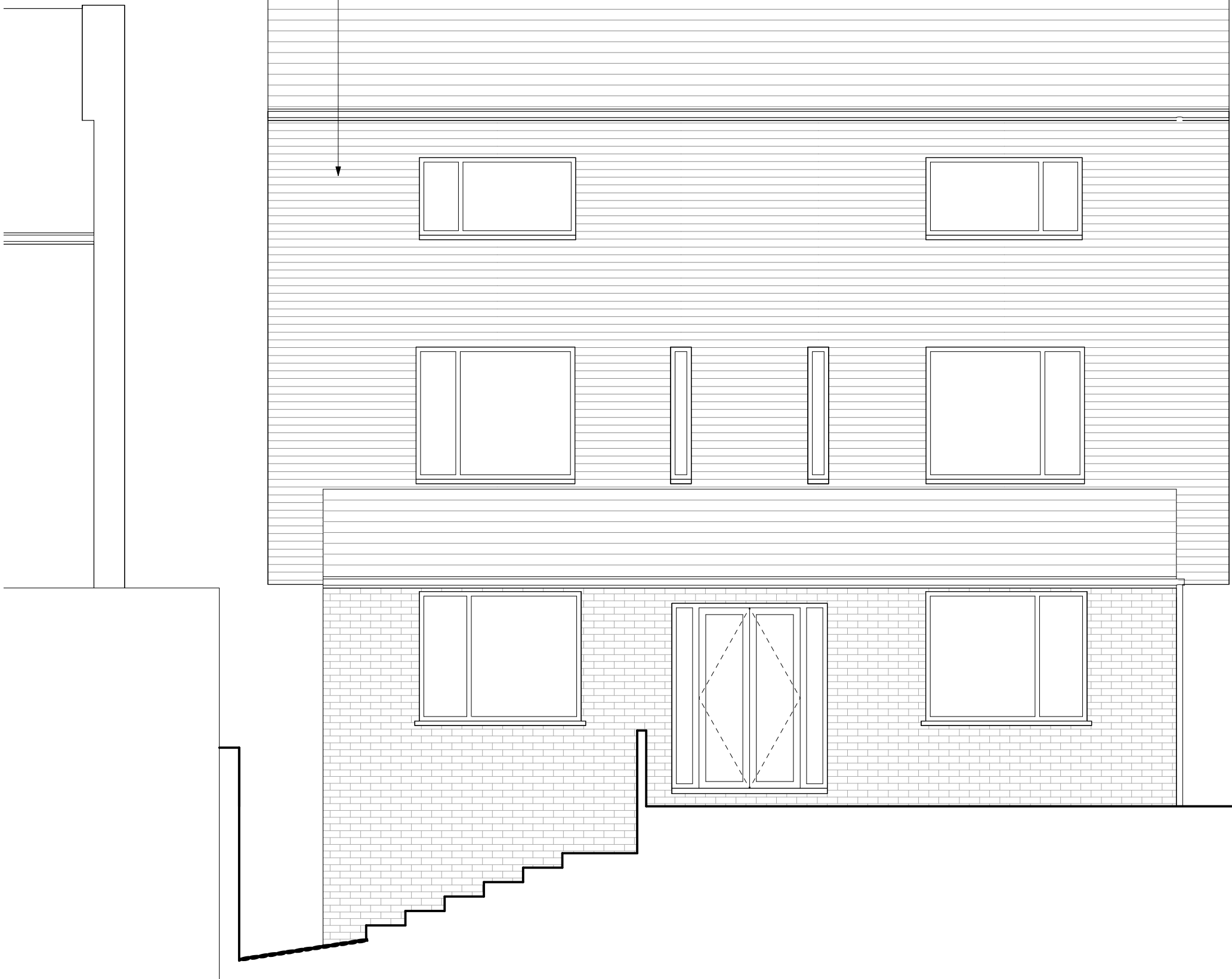
PROPOSED: REAR ELEVATION

Existing featheredge timber boarding to be repaired where necessary & re-stained