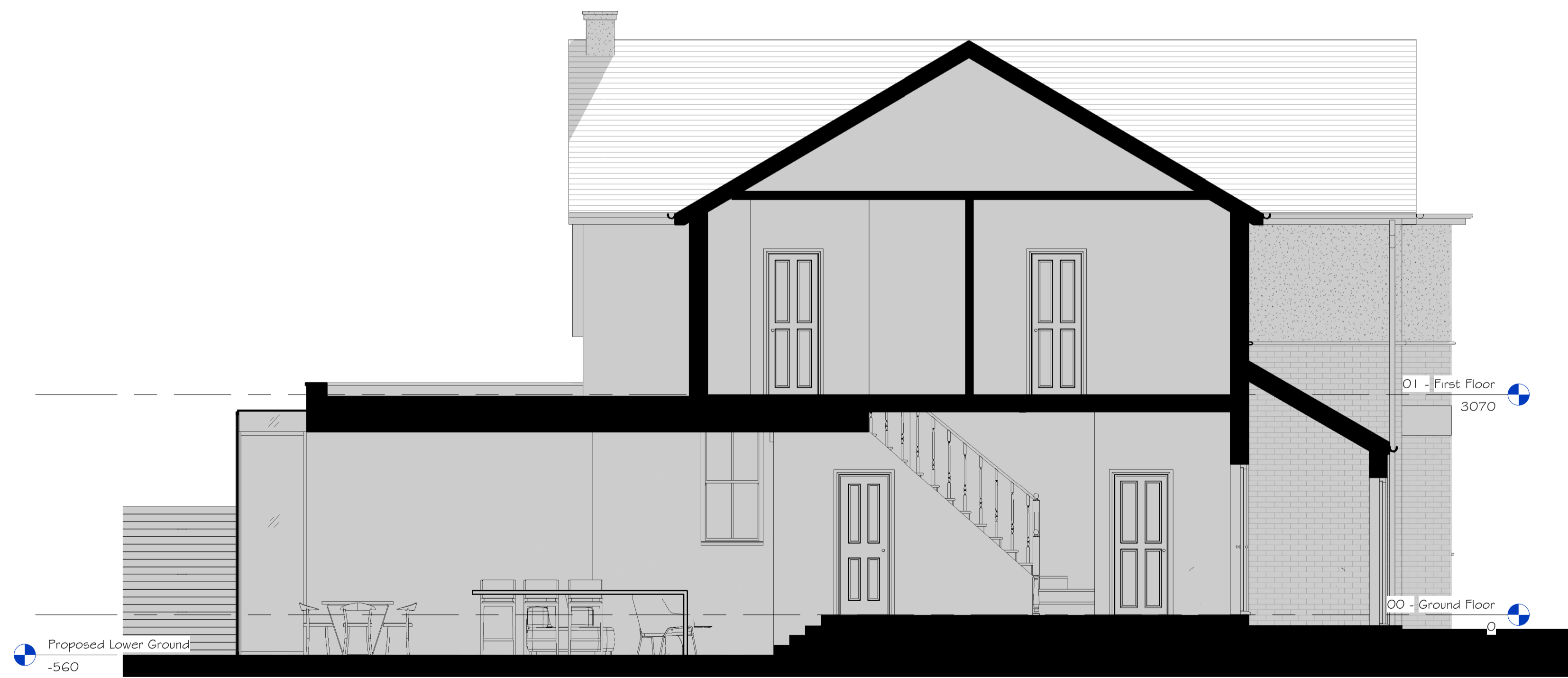
2 Proposed Section 1 : 50