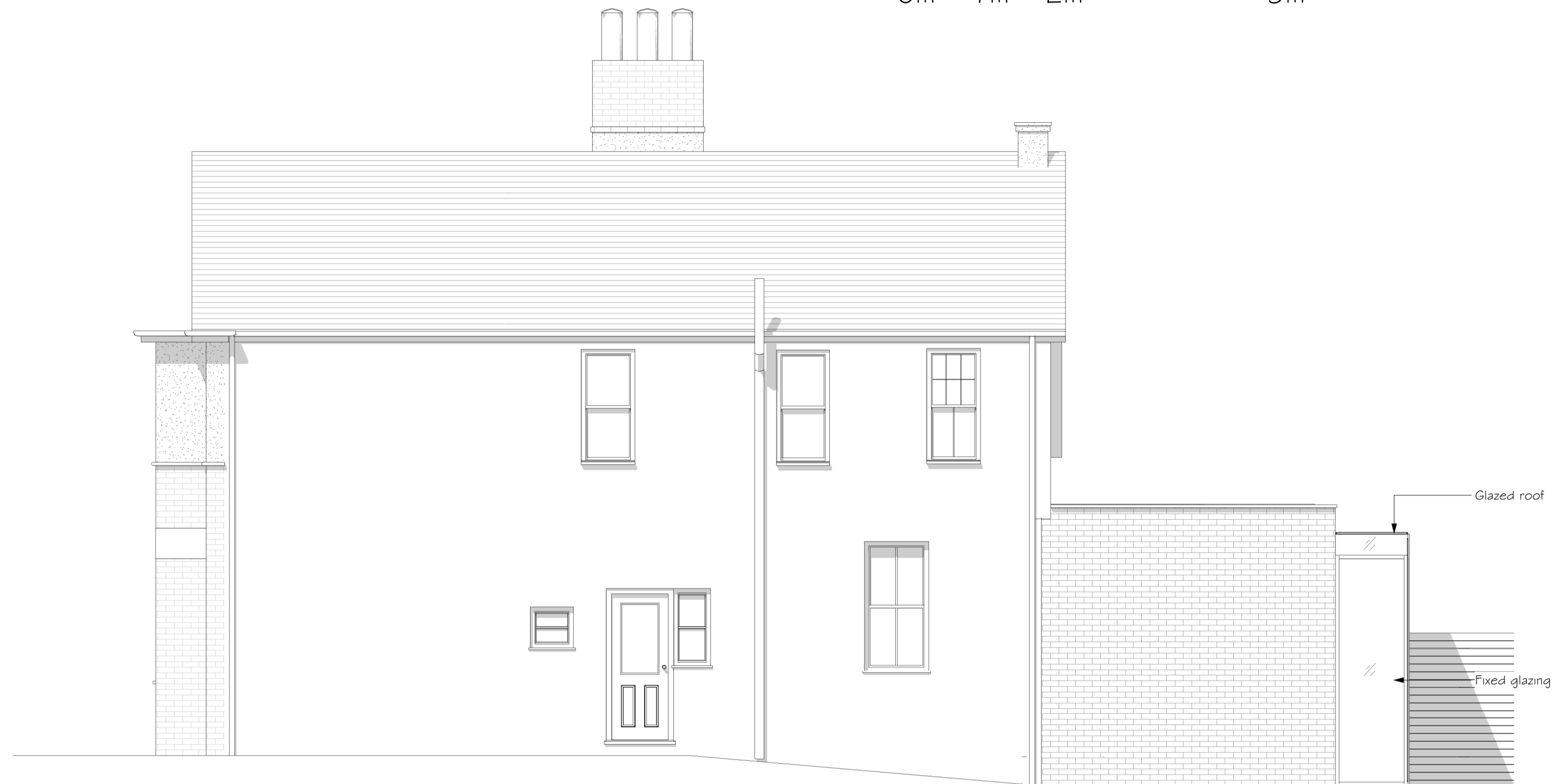
4 Proposed Side (East) Elevation 1 : 50