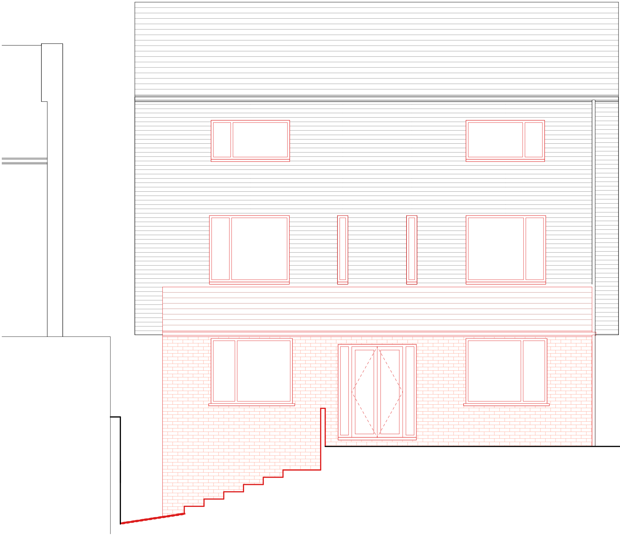
EXISTING: REAR ELEVATION