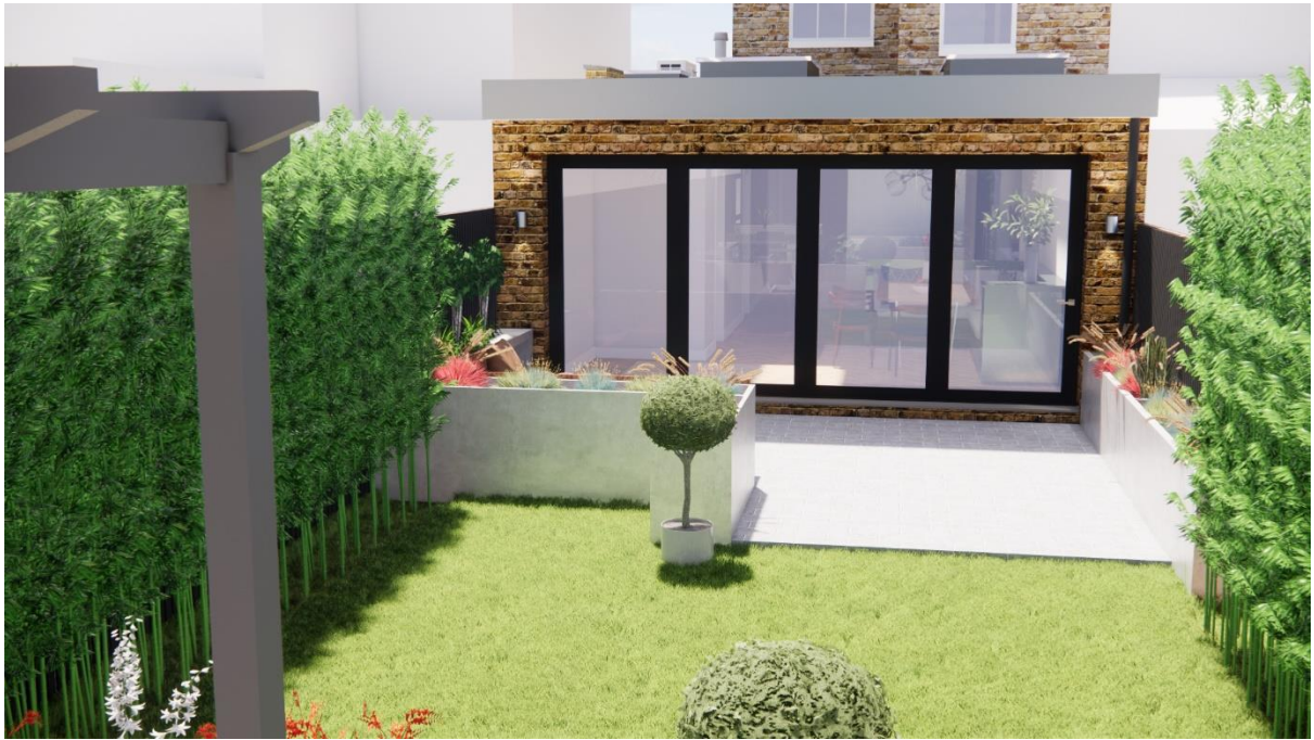
Proposed Rear View