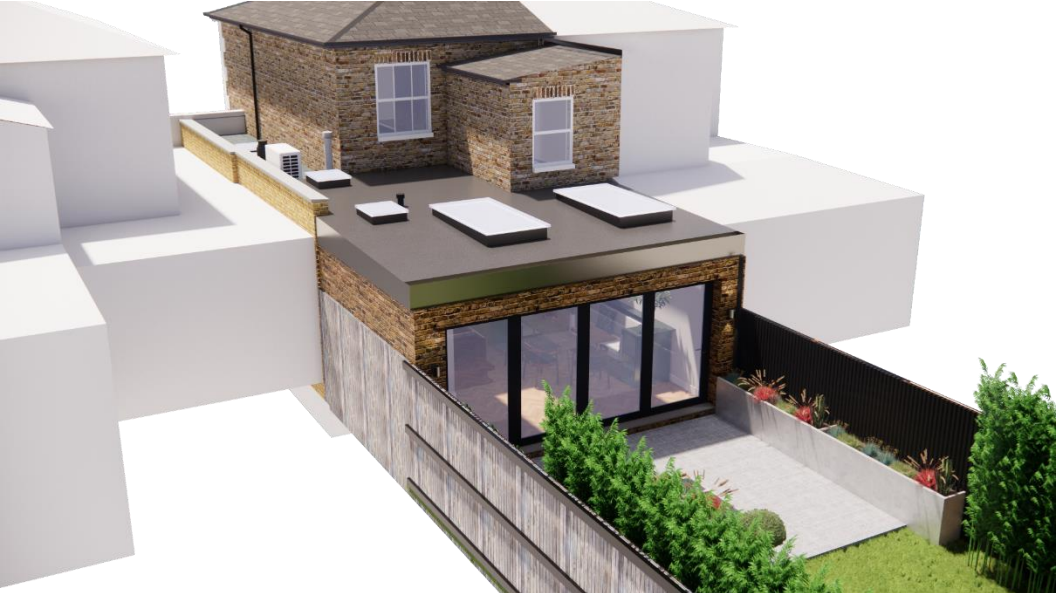
Proposed Rear View