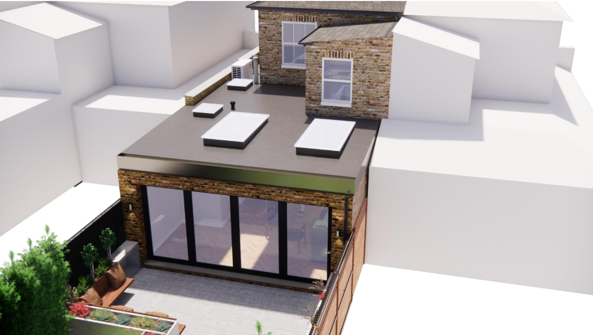
Proposed Rear View