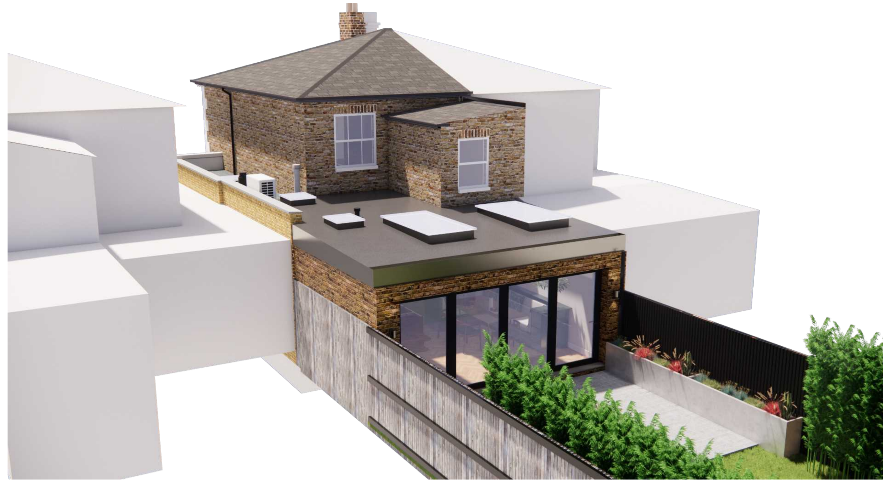
A 01 PROPOSED VIEW scale: