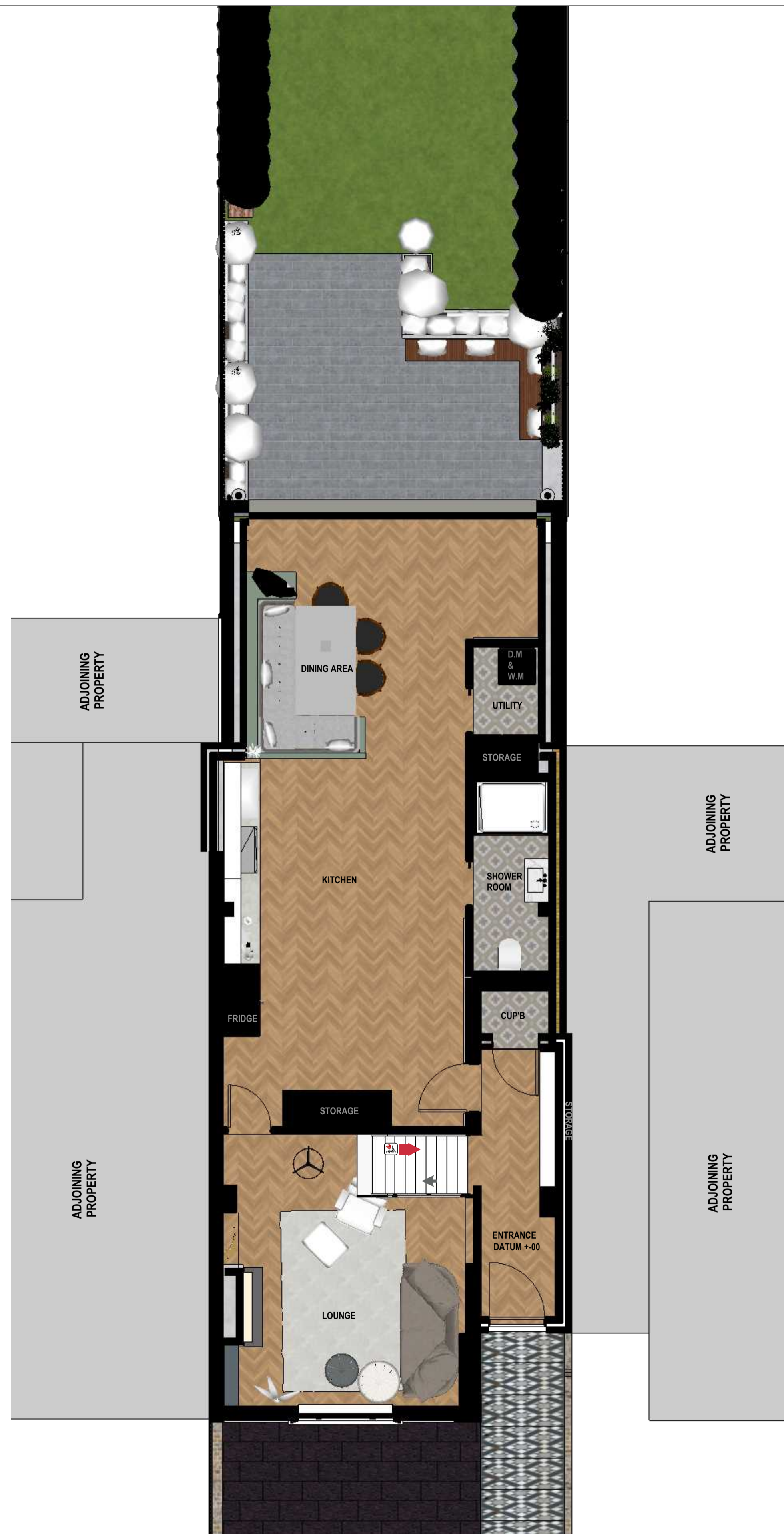
A 01 PROPOSED GROUND FLOOR PLAN scale: 1:50