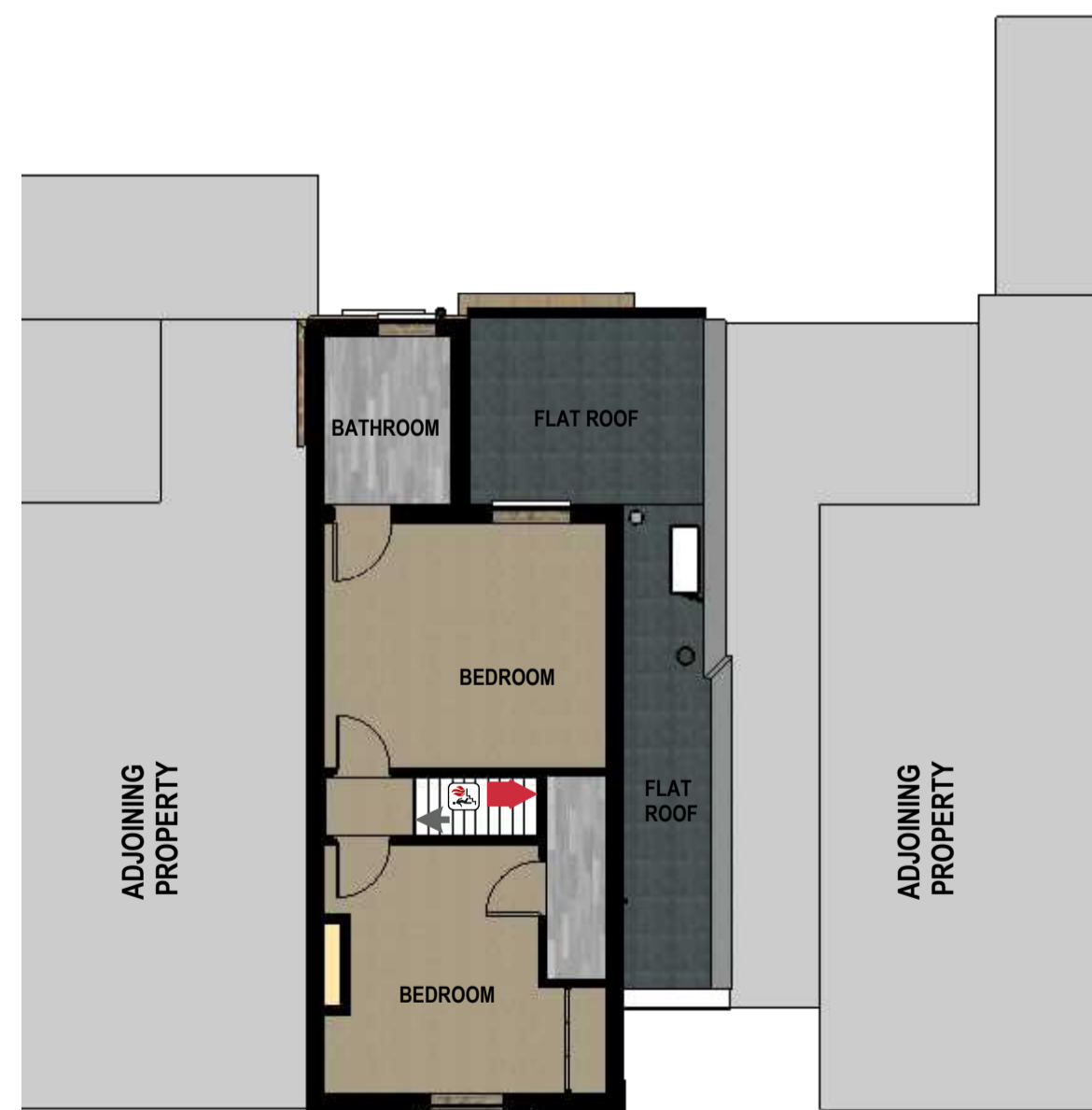
A 01 EXISTING FIRST FLOOR PLAN scale: 1:100