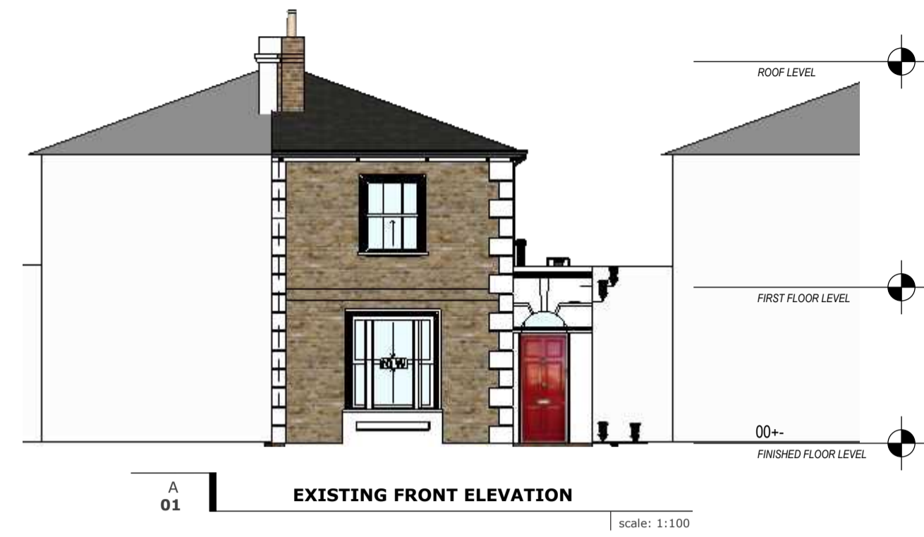
EXISTING FRONT ELEVATION A 01 | scale: 1:100