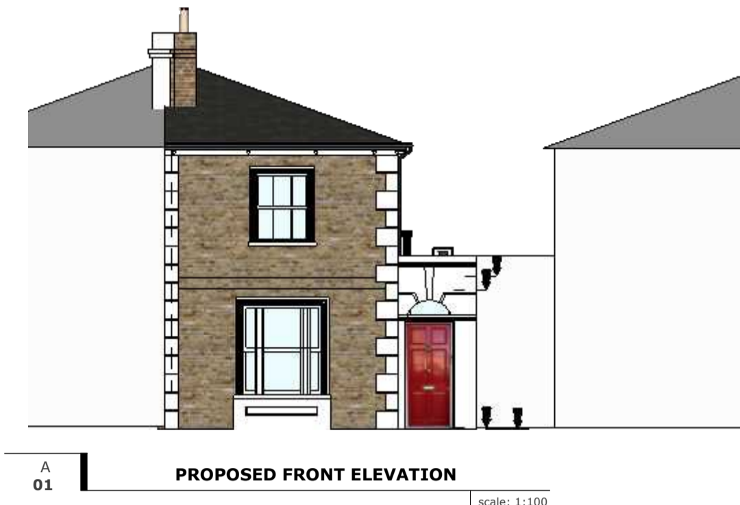
PROPOSED FRONT ELEVATION A 01 | scale: 1:100