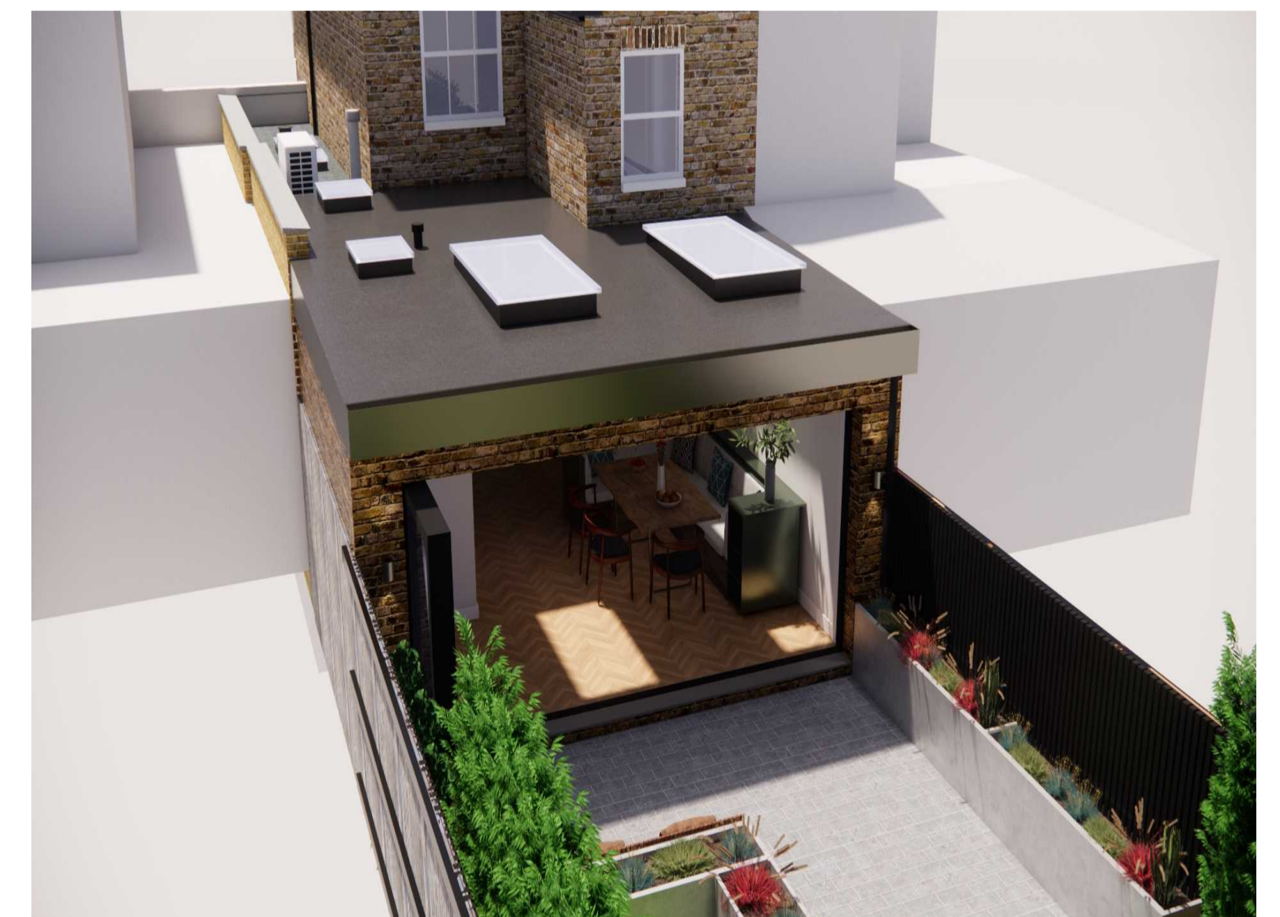
PROPOSED VIEW A 01 | scale: