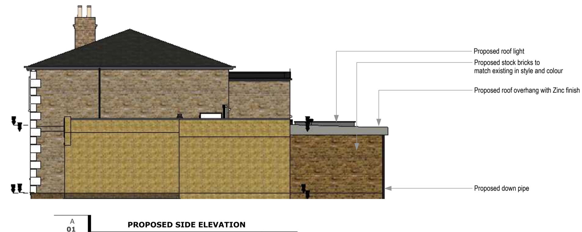
PROPOSED SIDE ELEVATION A 01 | scale: 1:100