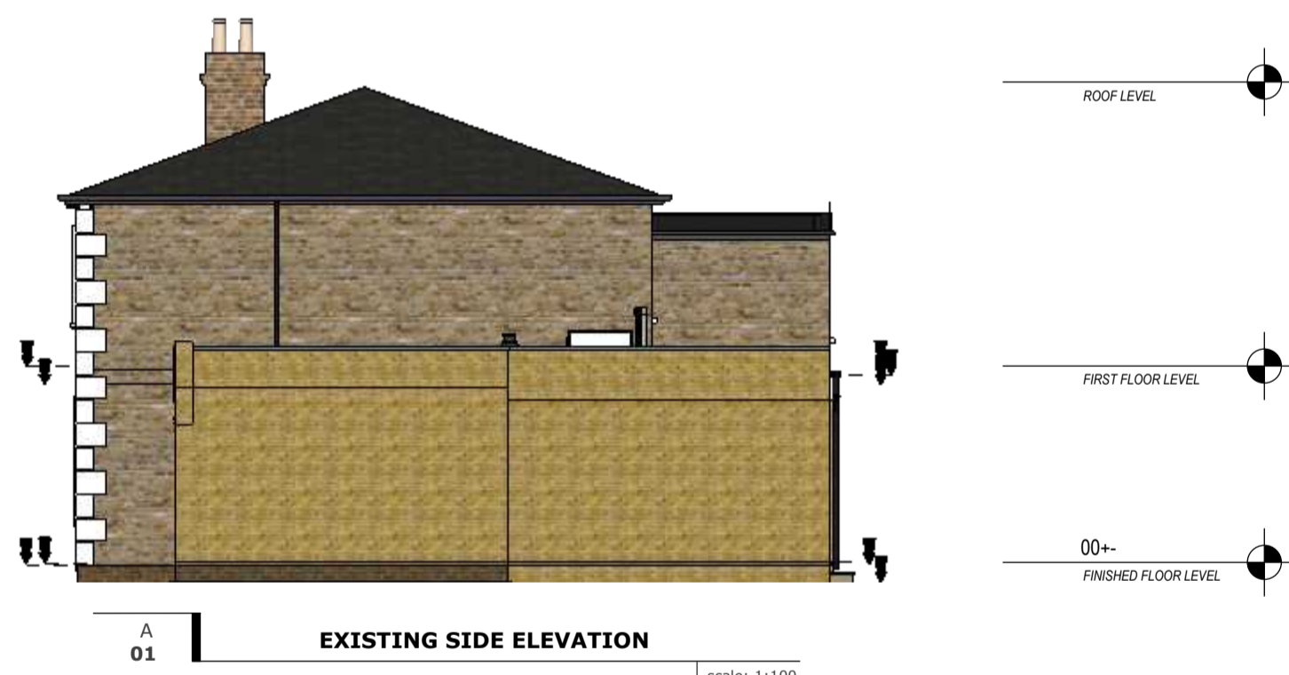
EXISTING SIDE ELEVATION A 01 | scale: 1:100