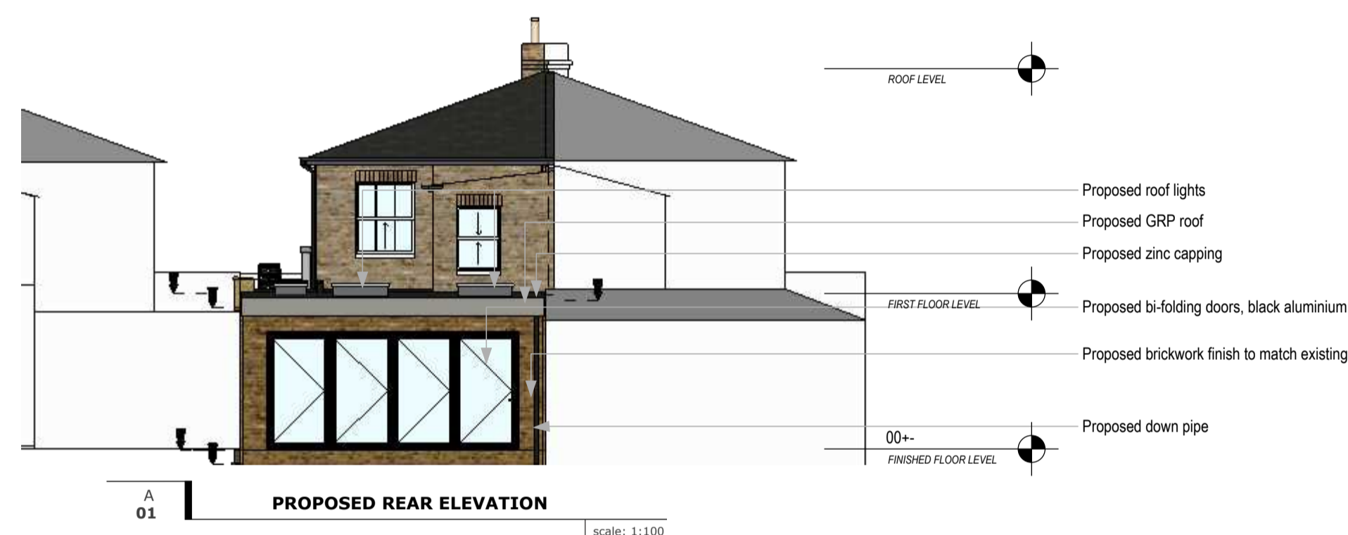
PROPOSED REAR ELEVATION A 01 | scale: 1:100