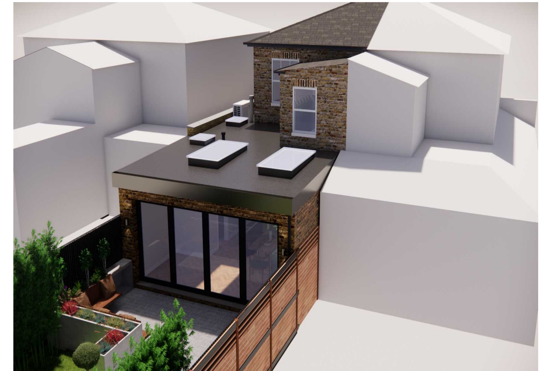
PROPOSED VIEW A 01 | scale: