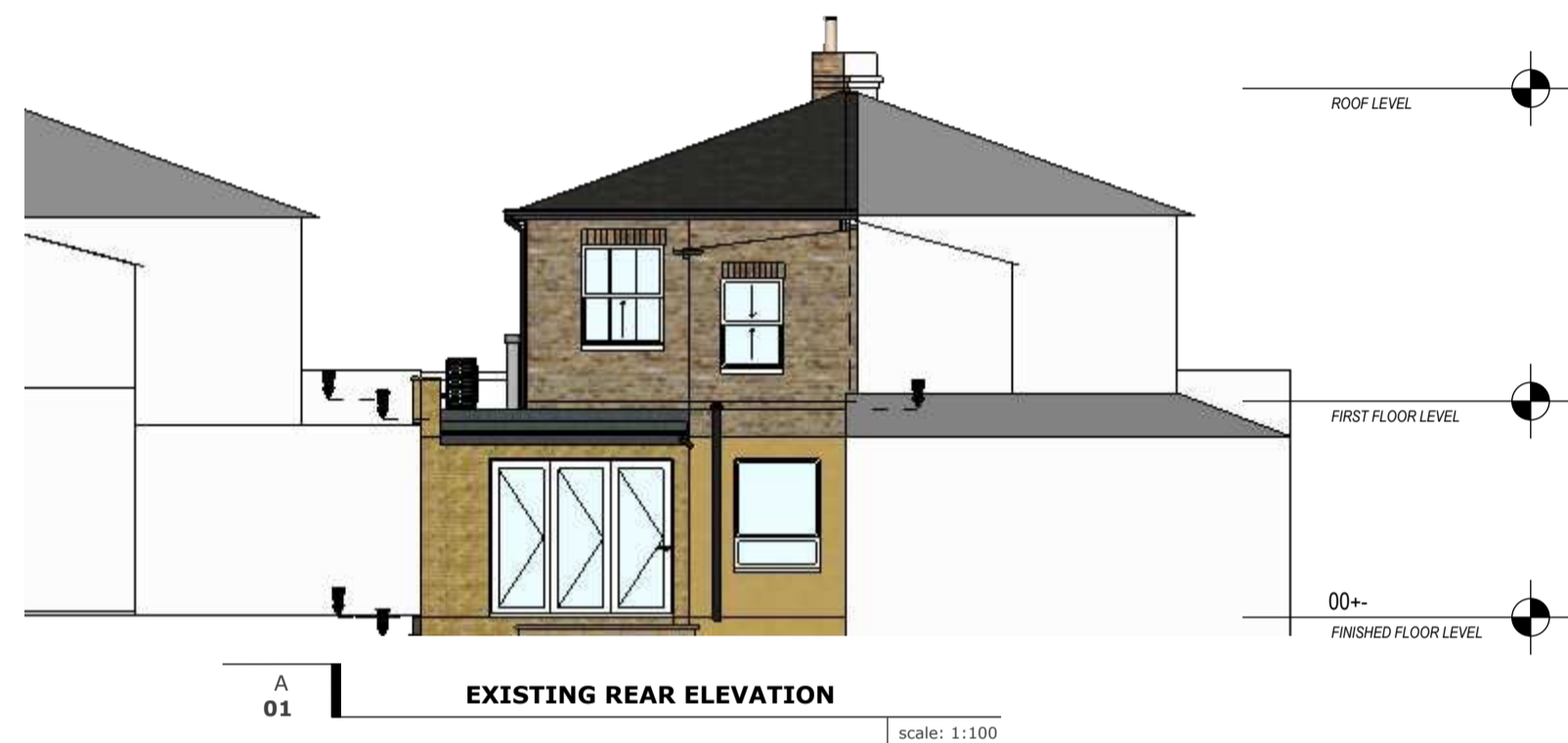
EXISTING REAR ELEVATION A 01 | scale: 1:100