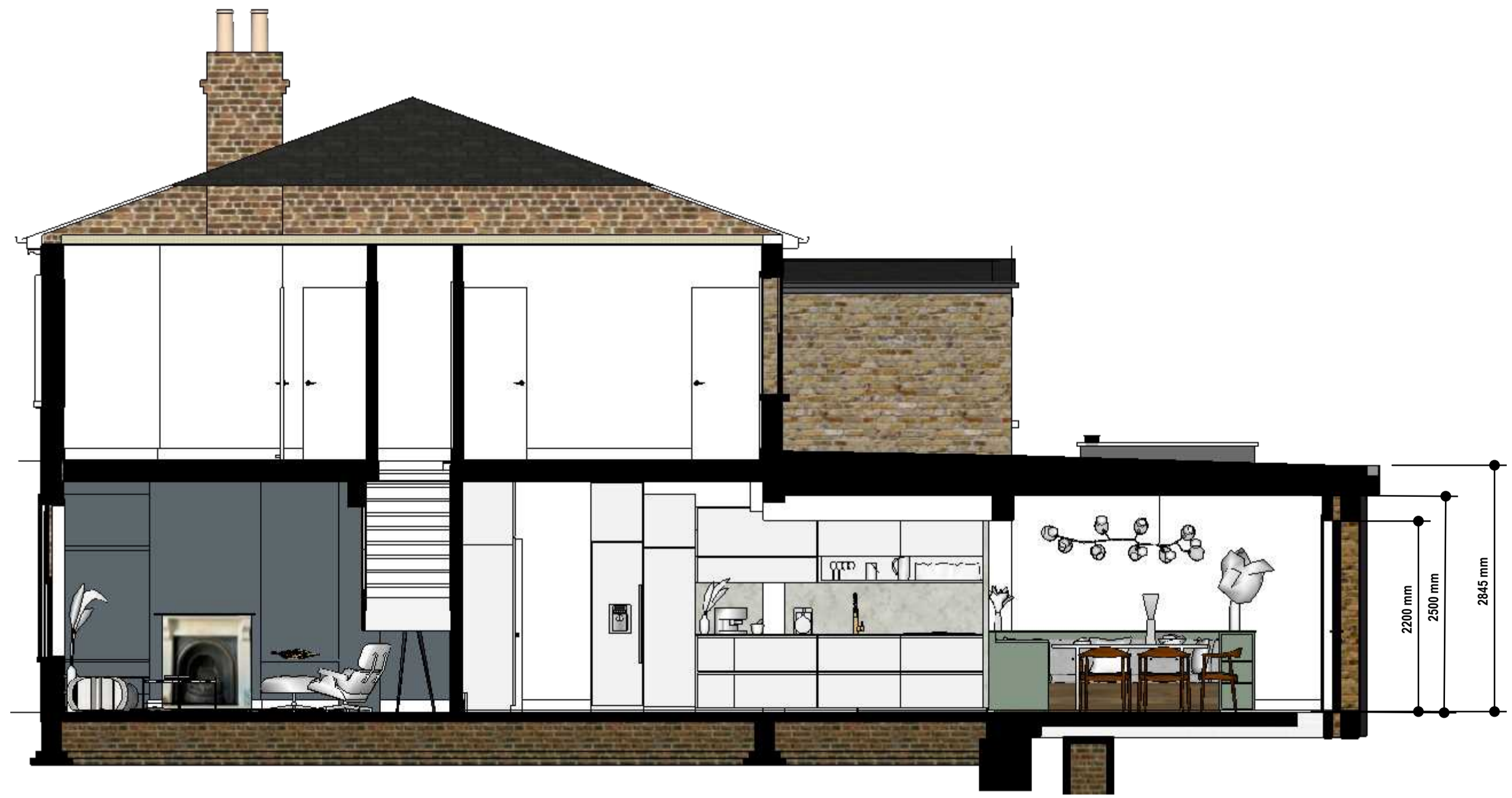
A 01 PROPOSED SECTION D-D scale: 1:50