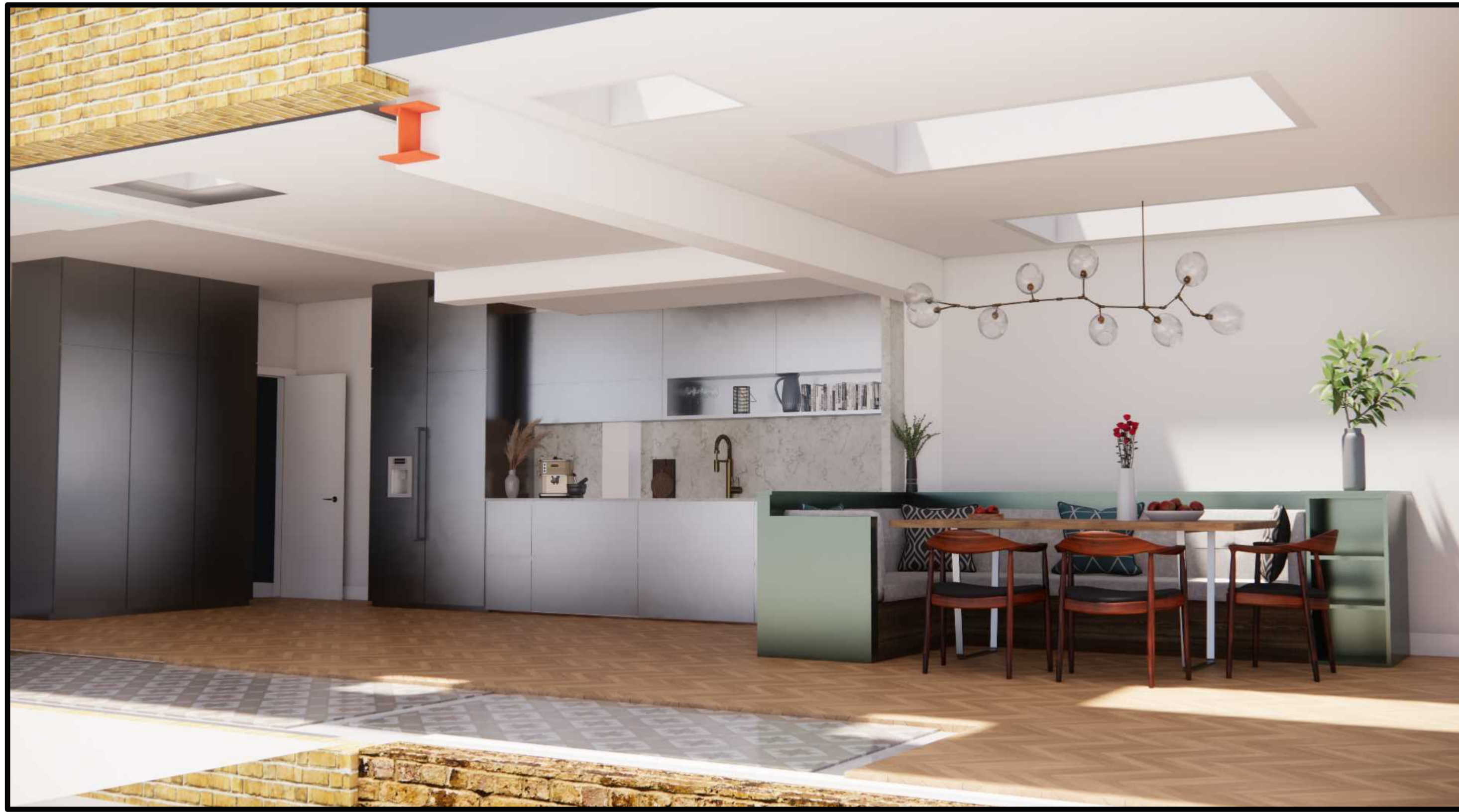
A 01 PROPOSED VIEW scale: