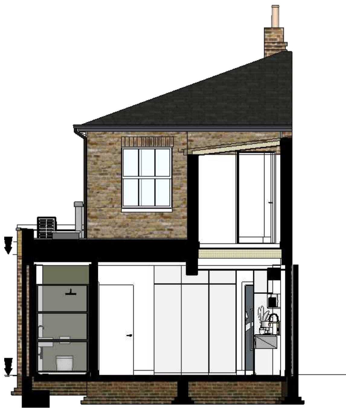
A 01 PROPOSED SECTION C-C scale: 1:50