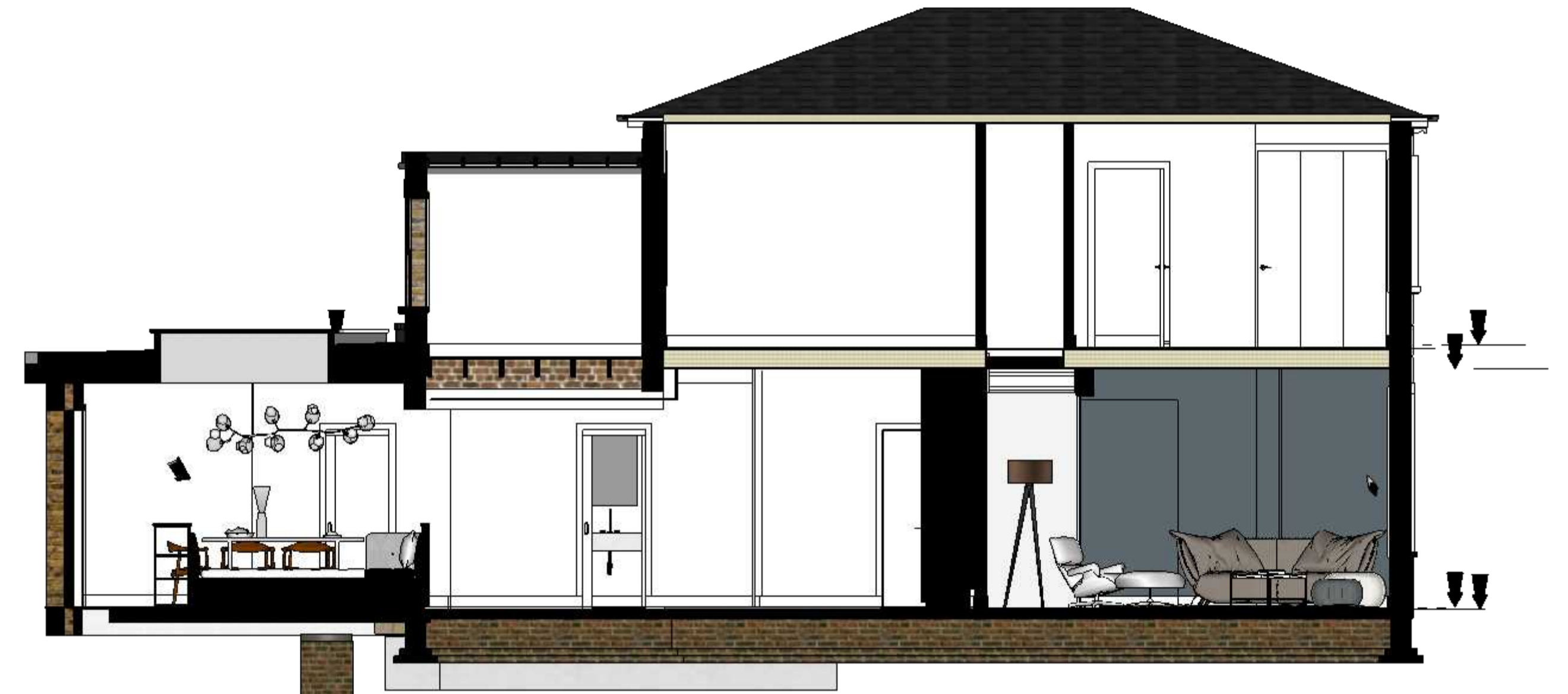
A 01 PROPOSED SECTION B-B scale: 1:50