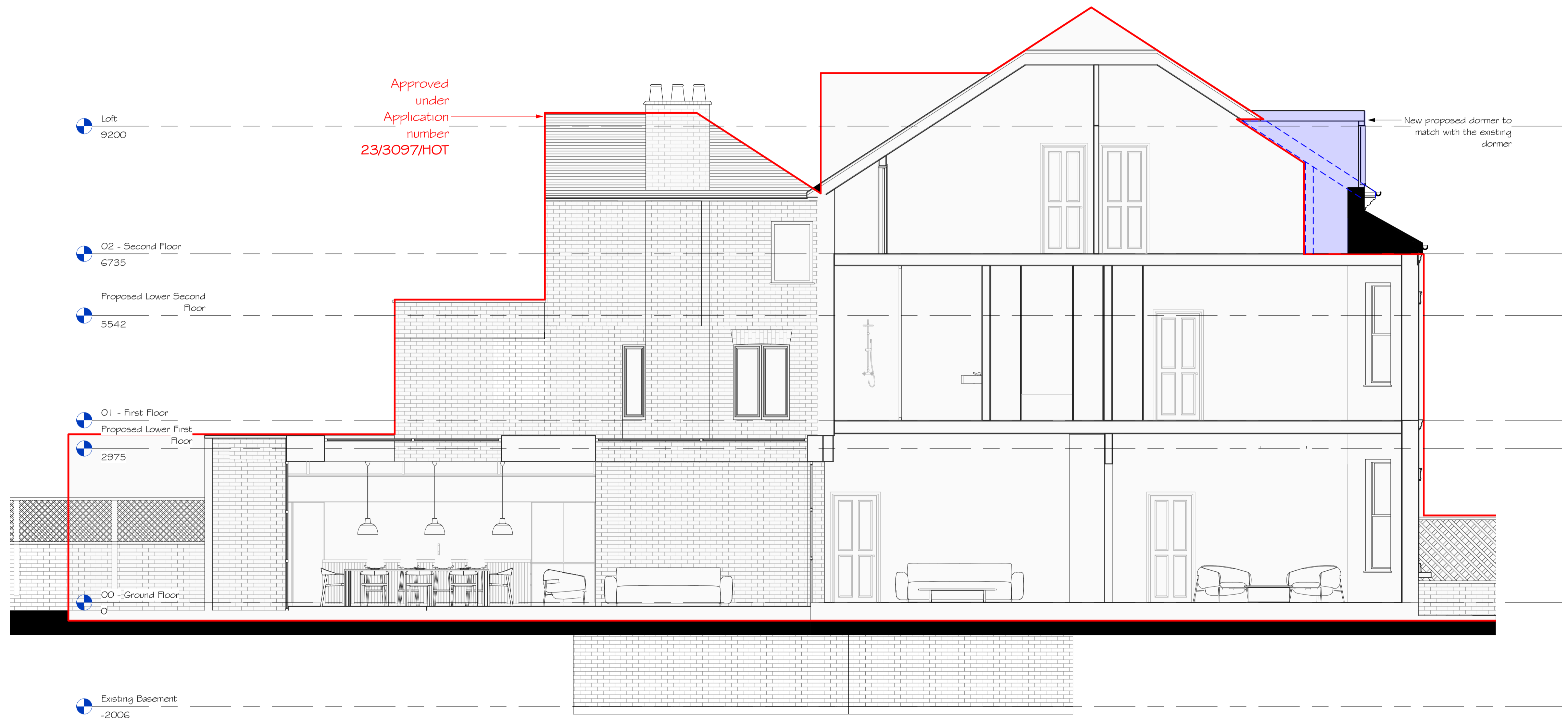
1 Proposed Section Kitchen 1 : 50