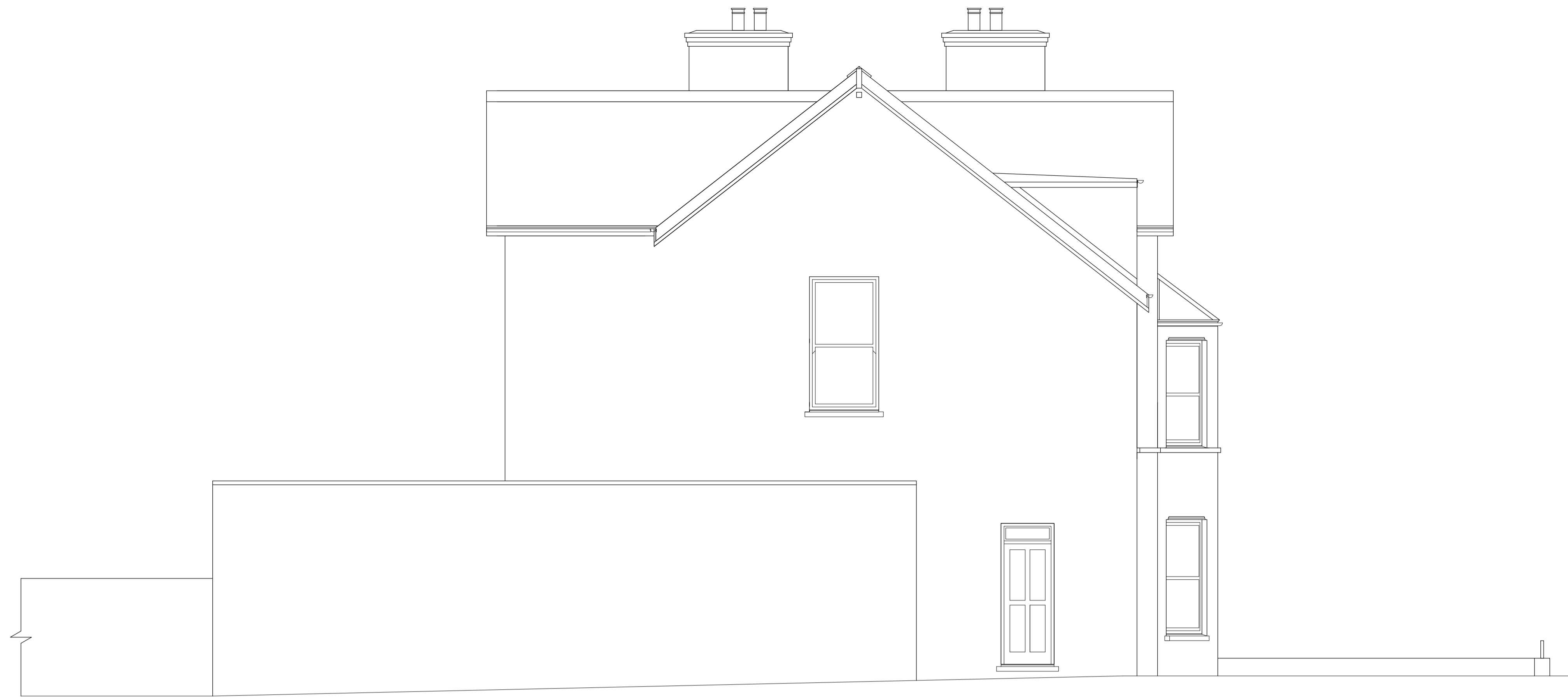
EXISTING SIDE ELEVATION (North - West)