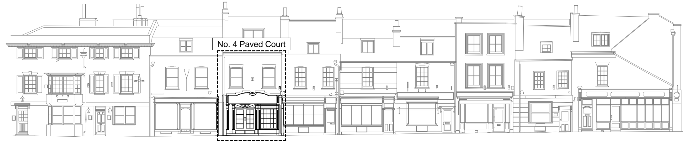
Paved Court Street Elevation Scale 1:500@A3