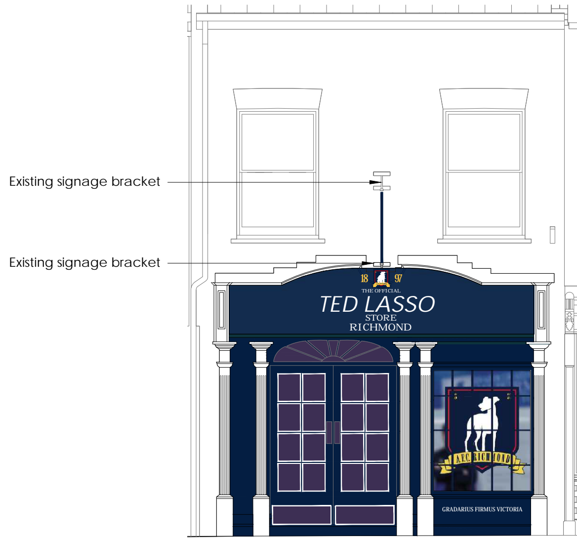
No. 4 Paved Court Elevation Scale 1:150@A3