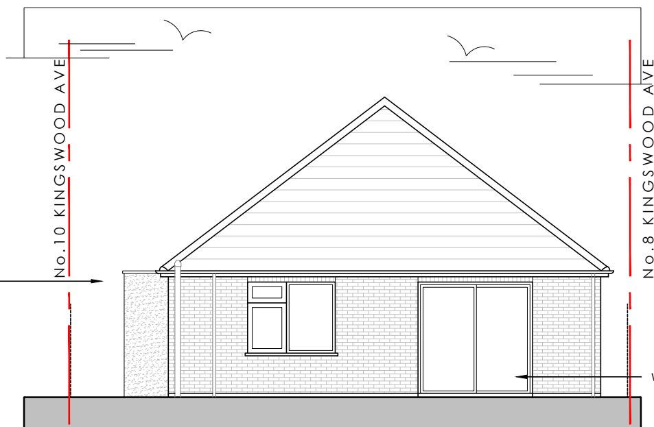
EXISTING REAR ELEVATION 1:100 @ A3

EXISTING SIDE EXTENSION WITH RENDER FINISH.