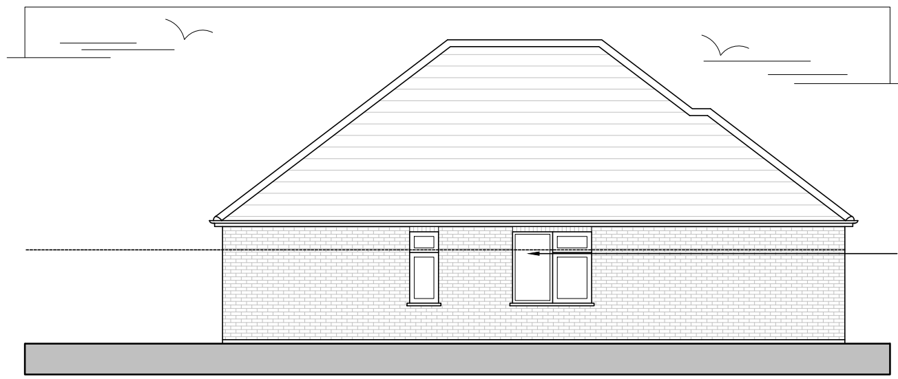
EXISTING SIDE ELEVATION (SOUTH) 1:100 @ A3