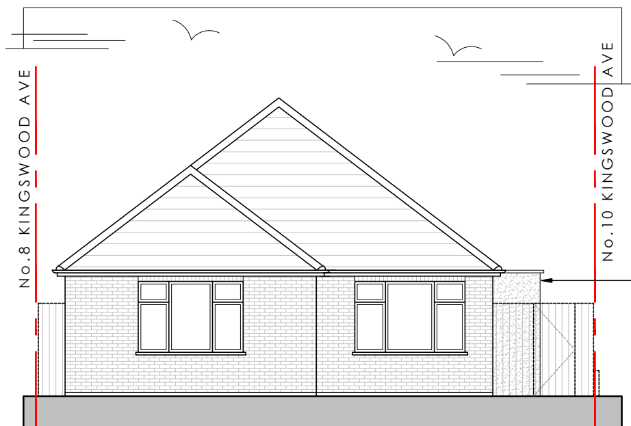
EXISTING FRONT ELEVATION 1:100 @ A3