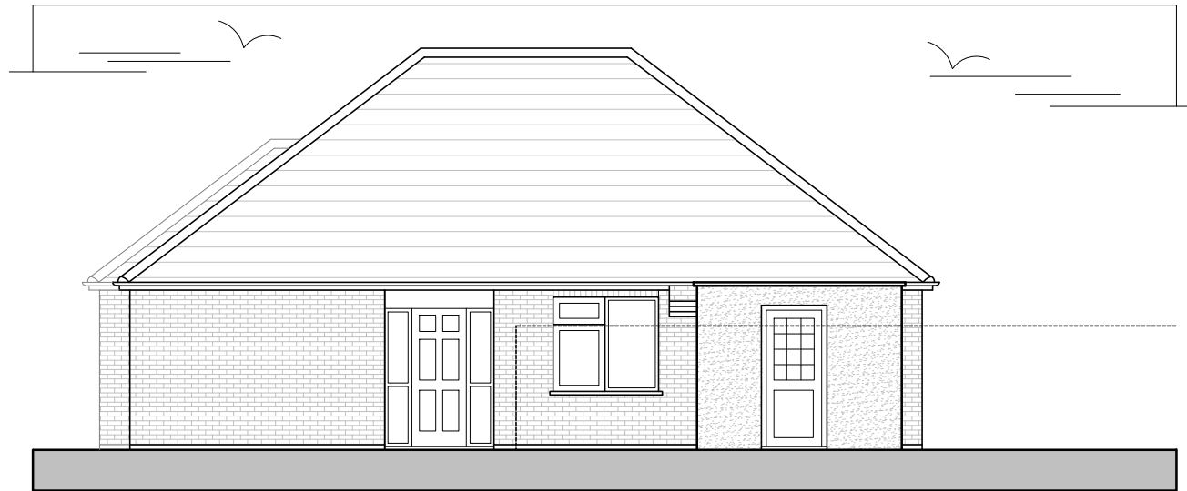
EXISTING SIDE ELEVATION (NORTH) 1:100 @ A3