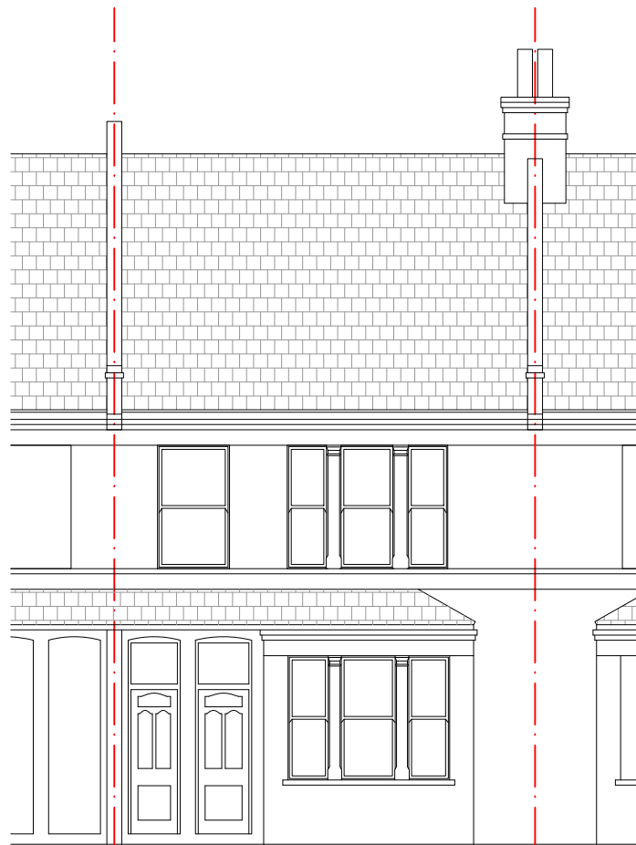
EXISTING FRONT ELEVATION 1:100 @ A3