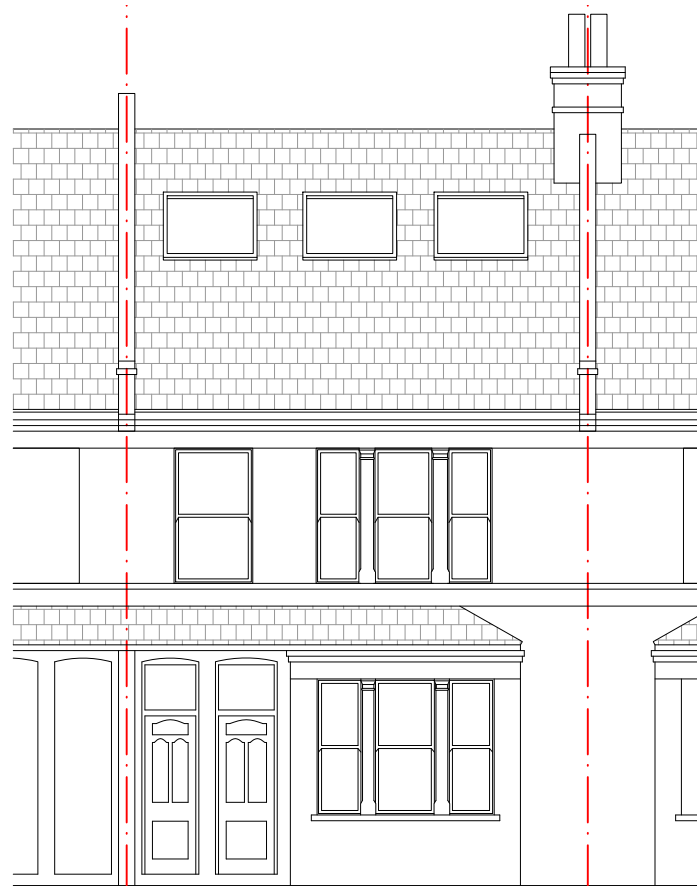
PROPOSED FRONT ELEVATION 1:100 @ A3