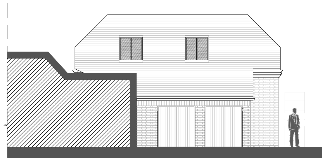
GARDEN REAR ELEVATION (SOUTH EAST)