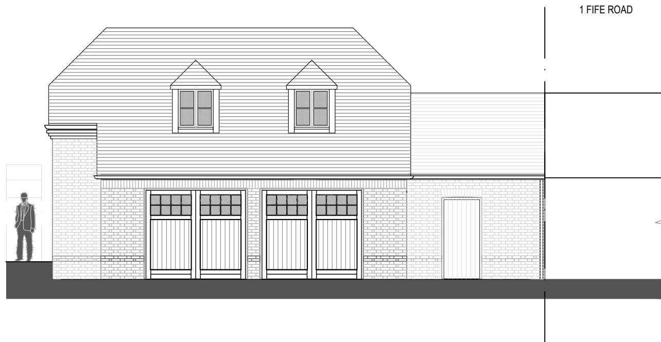
ROAD ELEVATION (NORTH WEST)

Adjoining properties // Assumed/ hidden // Existing structure ■ PROPOSED LEGEND ▨ New walls ▤ New exteriors ▧ New Glazing