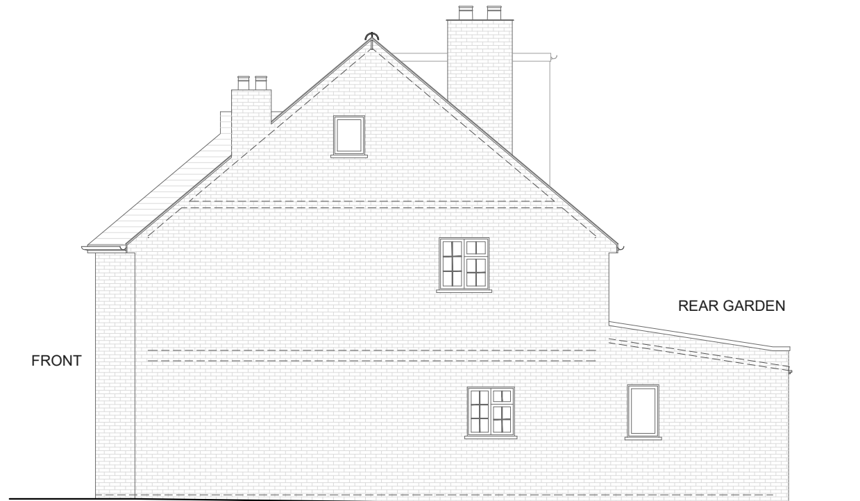
EXISTING SOUTH ELEVATION SCALE 1:100