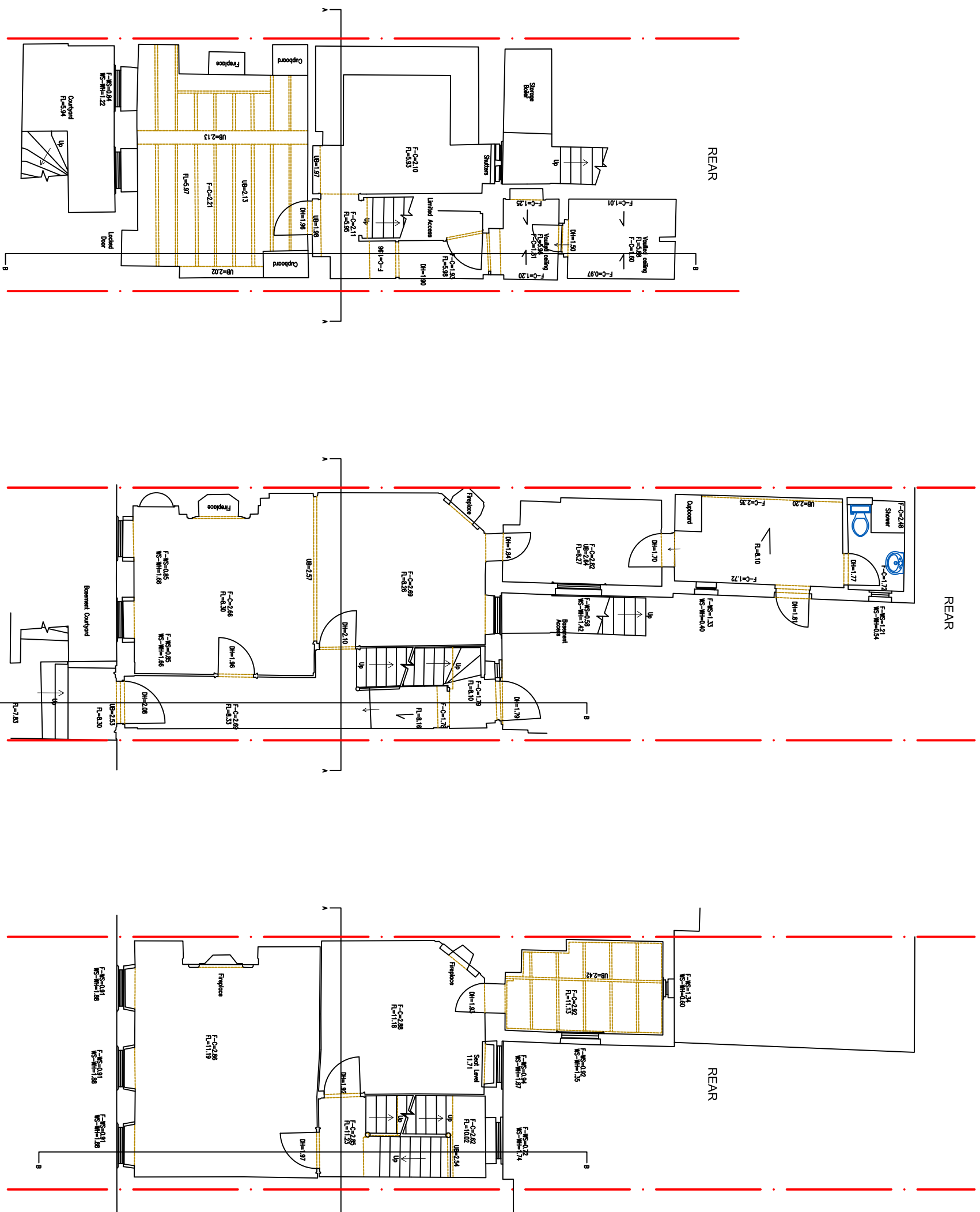
Proposed Lower Ground Floor Plan (no change) 1:100@A3