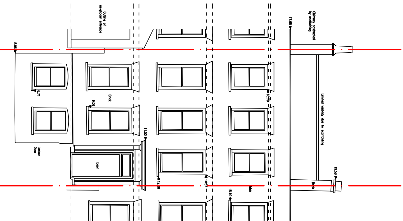
Existing Front Elevation 1:100@A3