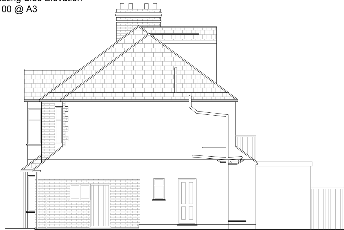
04 Existing Side Elevation 1:100 @ A3