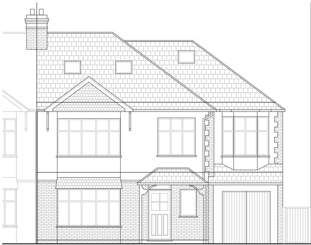
01 Existing Front Elevation 1:100 @ A3