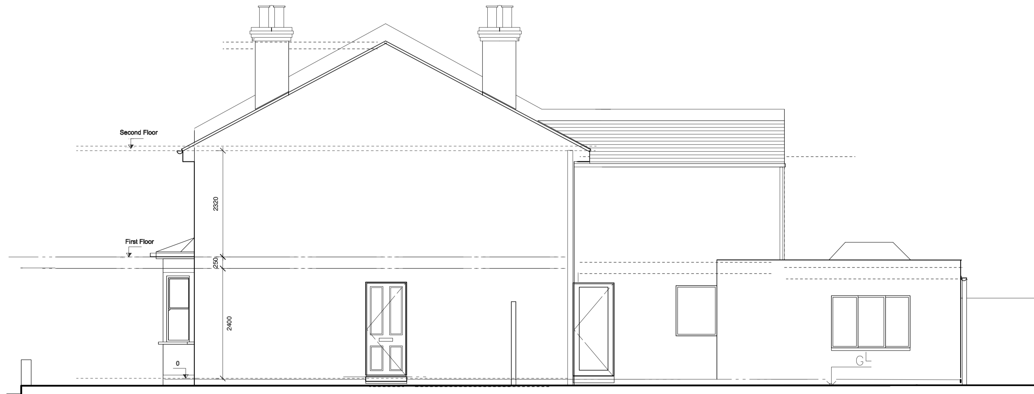
EXISTING SIDE ELEVATION 1:50