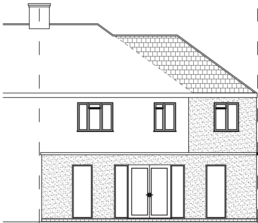
2 Proposed Rear Elevation SCALE: 1:100