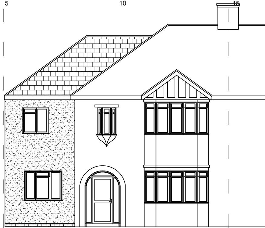
1 Proposed Front Elevation SCALE: 1:100