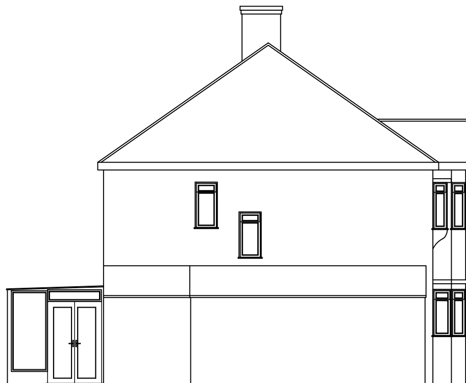
3 Existing Side Elevation SCALE: 1:100