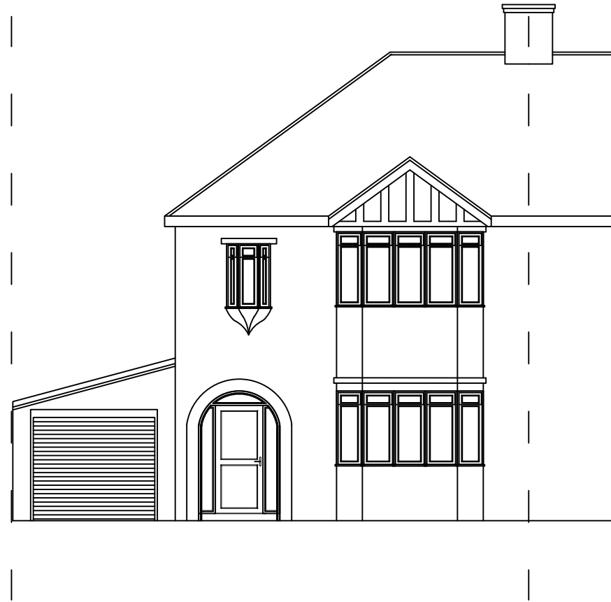
1 Existing Front Elevation SCALE: 1:100