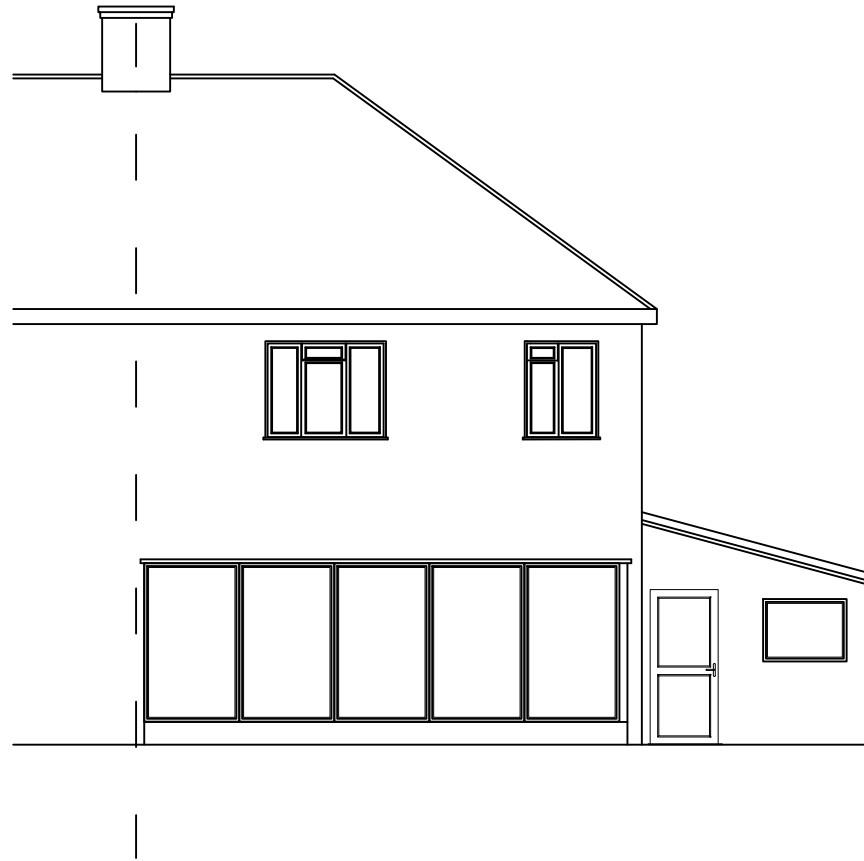
2 Existing Rear Elevation SCALE: 1:100