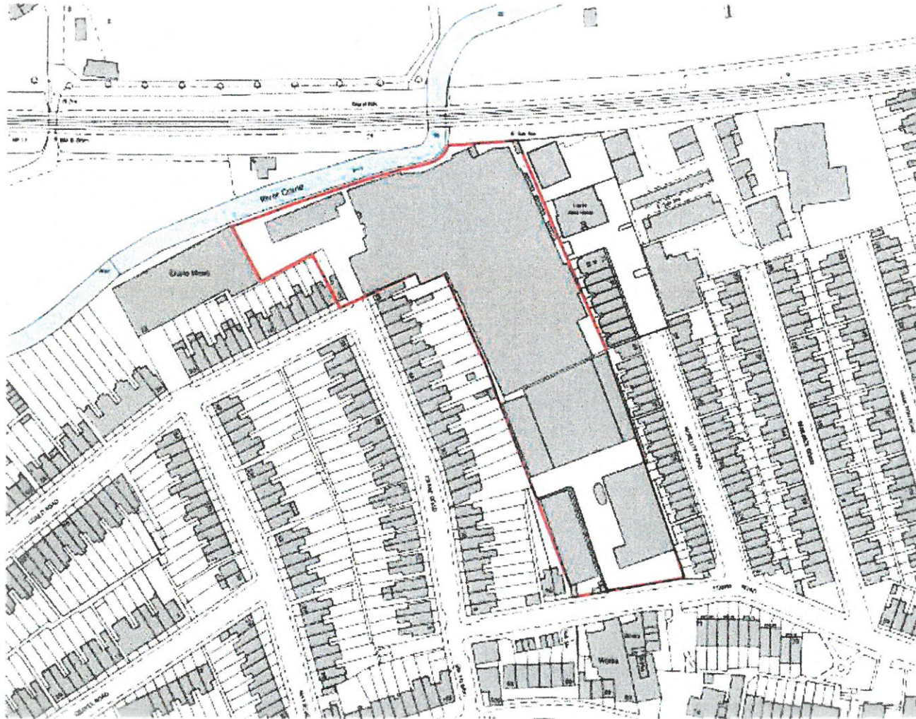
Existing site plan