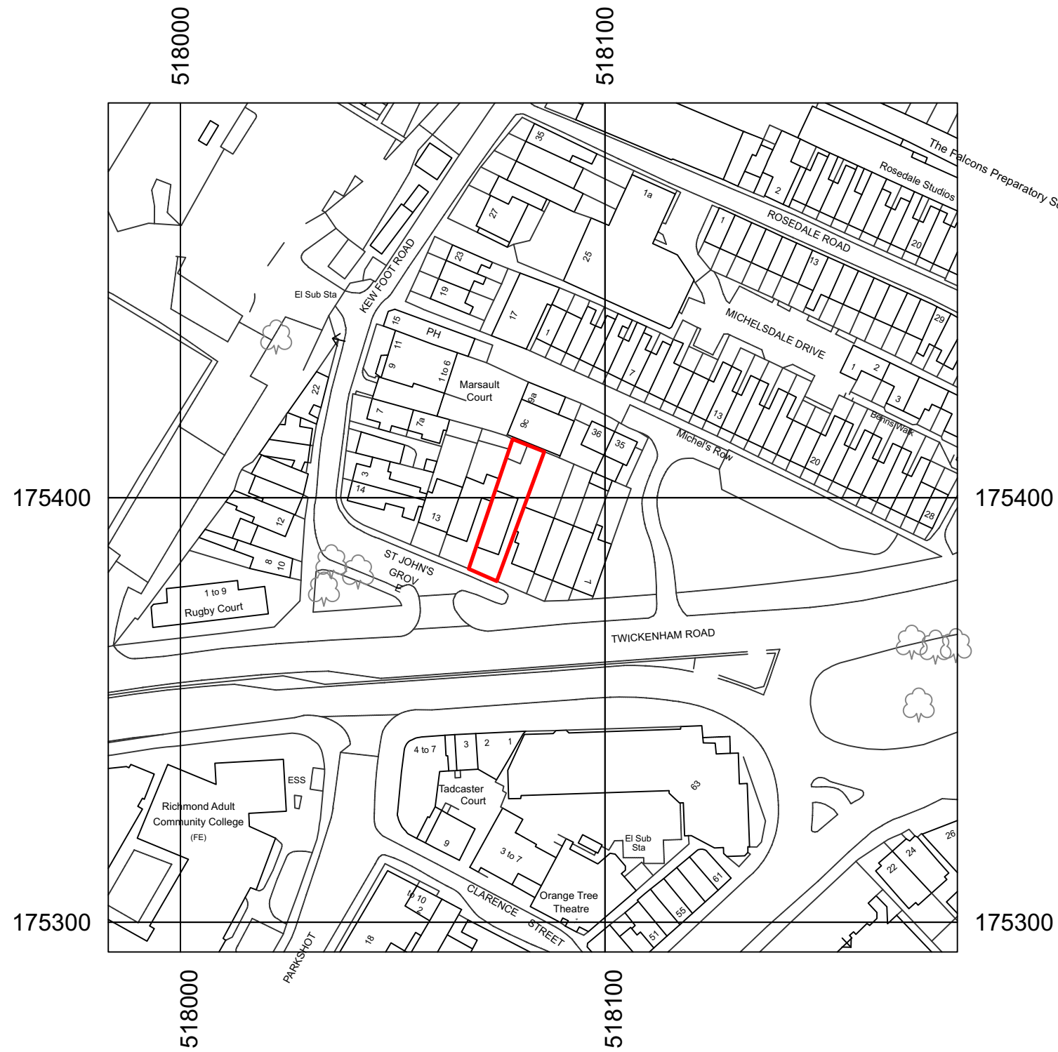
1 LOCATION PLAN Scale 1:1250@A3

DO NOT SCALE FROM THIS DRAWING. CONTRACTOR TO VERIFY ALL DIMENSIONS PRIOR TO CONSTRUCTION. ANY DISCREPANCIES ARE TO BE REPORTED TO THE ARCHITECT. REMOVE THIS DRAWING FROM CIRCULATION WHEN REVISED DRAWING IS ISSUED.