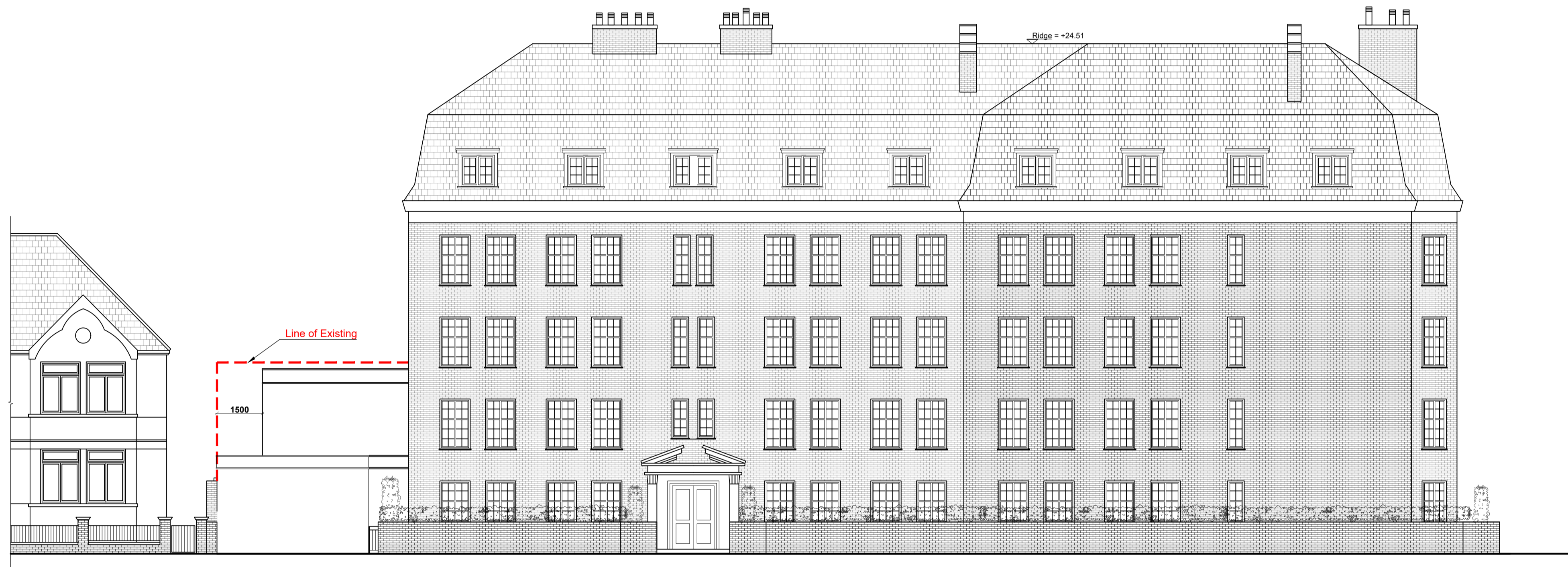
Proposed Lebanon Park Street Elevation Scale 1:100