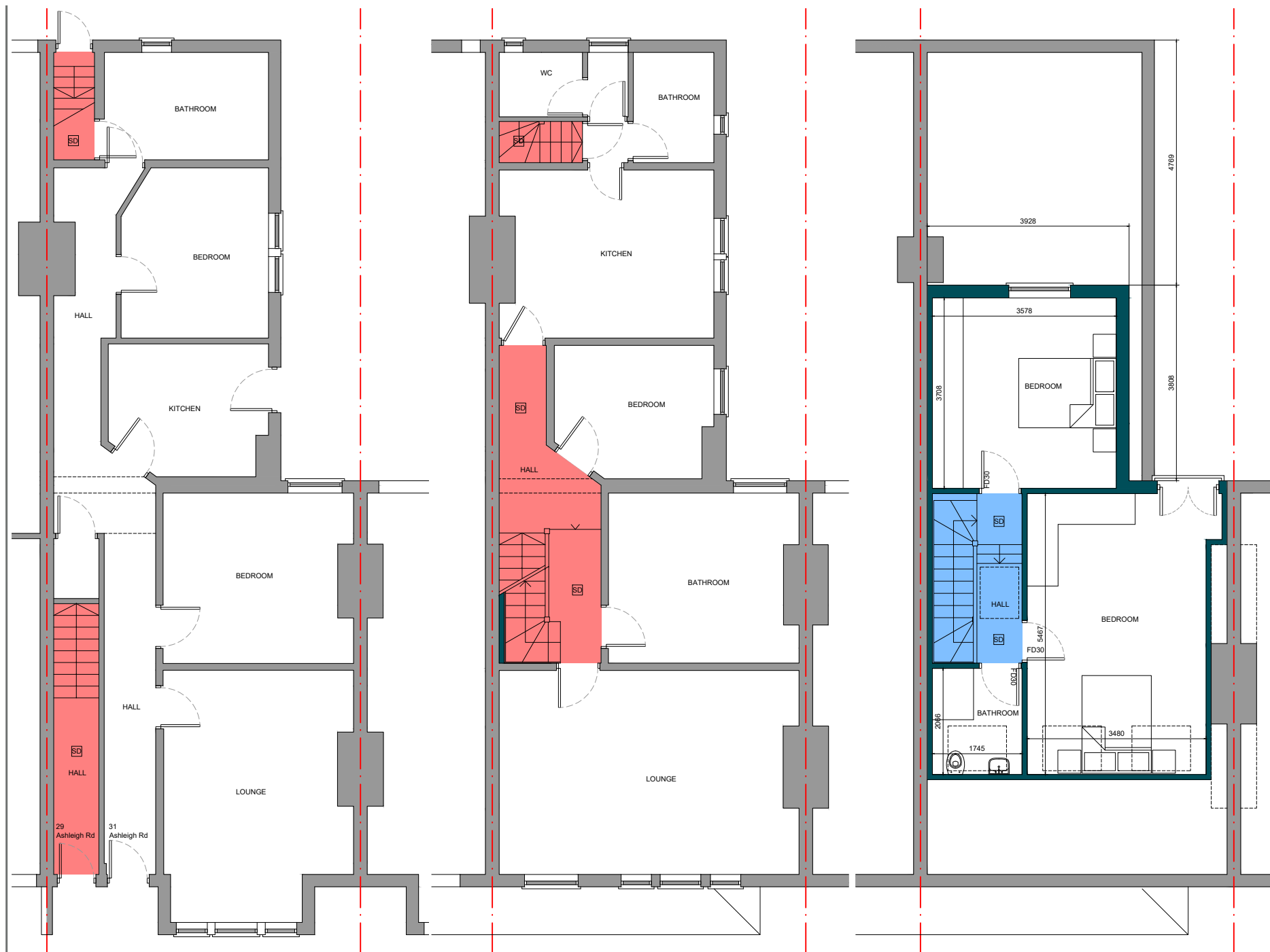
PROPOSED GROUND FLOOR PLAN 1:100 @ A3