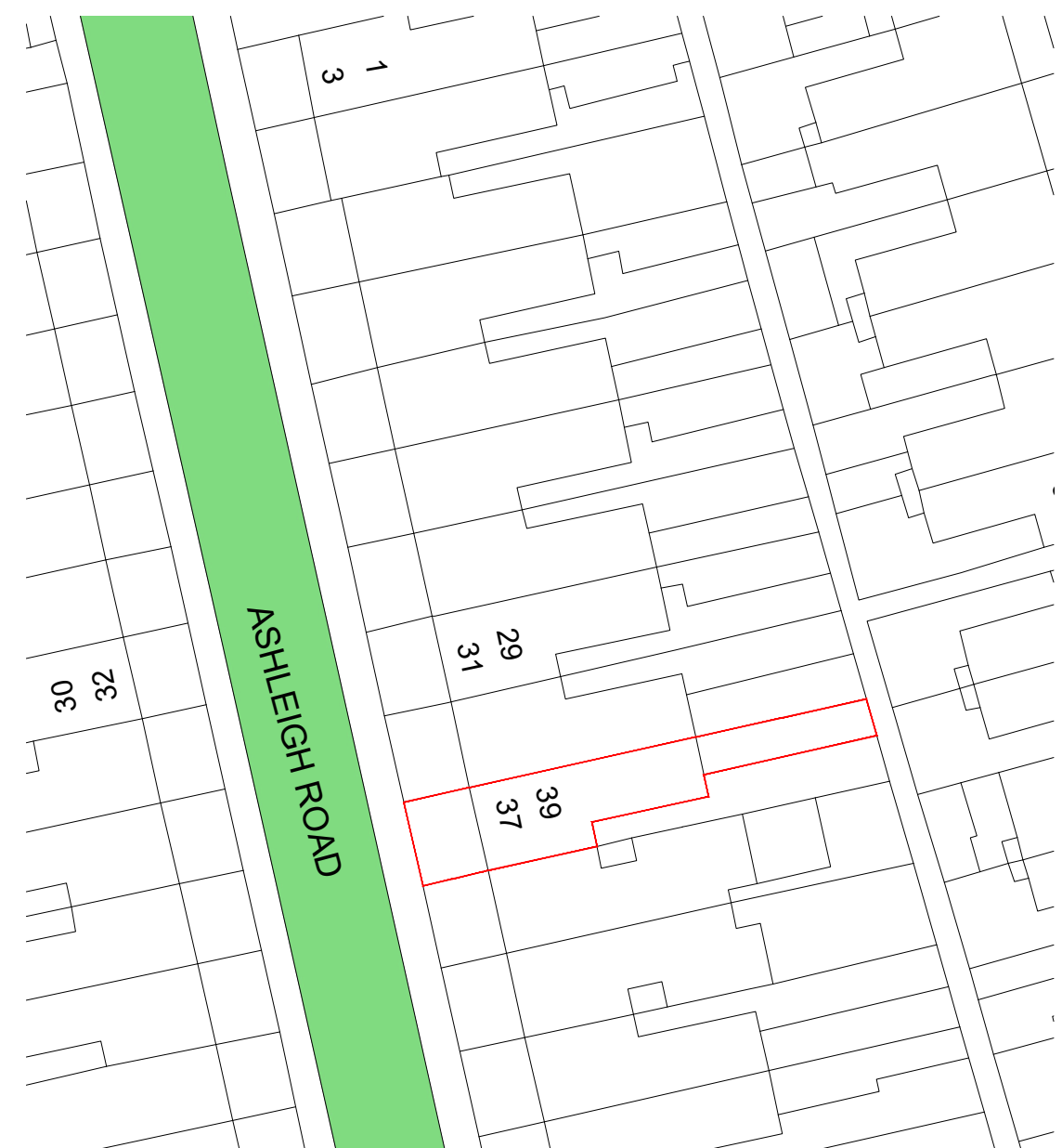
LOCATION PLAN 1:500 @ A3