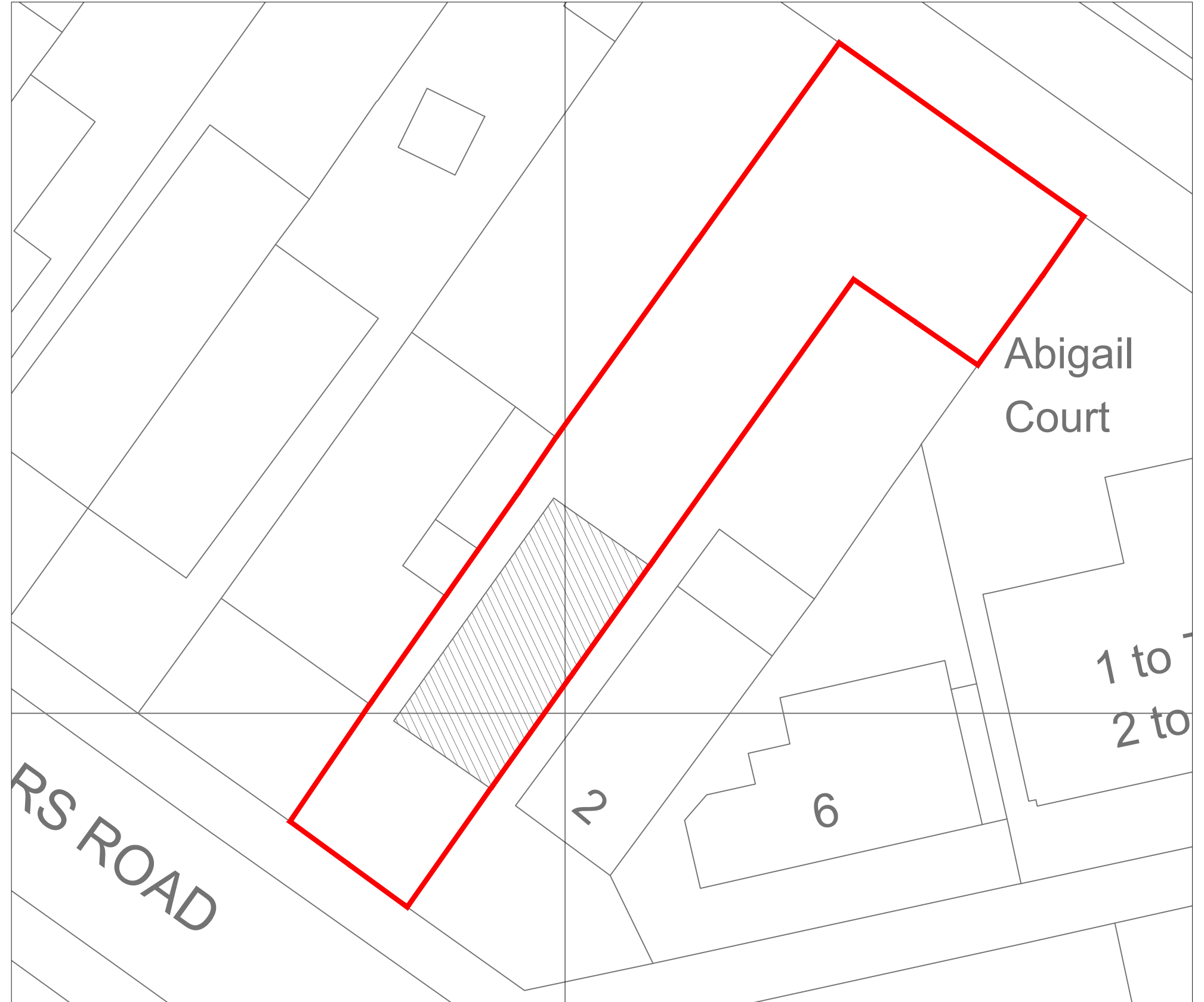
BLOCK PLAN 1:200 @ A3