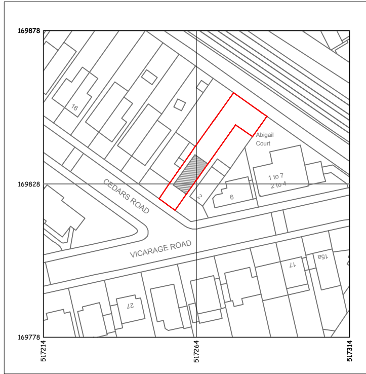
LOCATION PLAN 1:1250 @ A3