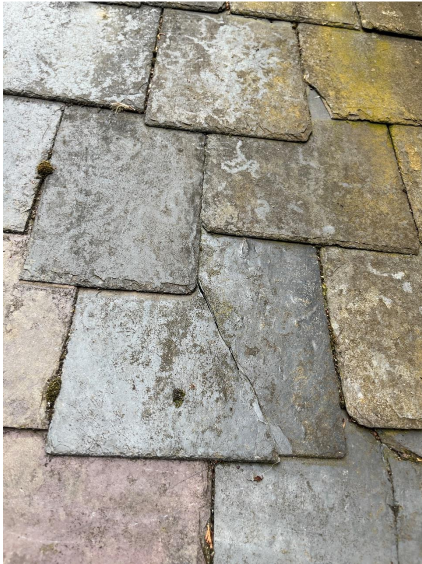
Figure 4: Drama Hall Studio Roof - Externals