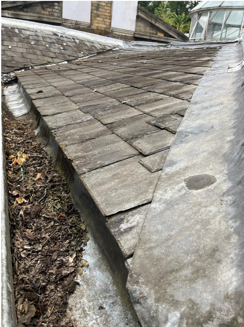
Figure 2: Drama Hall Studio Roof - Externals