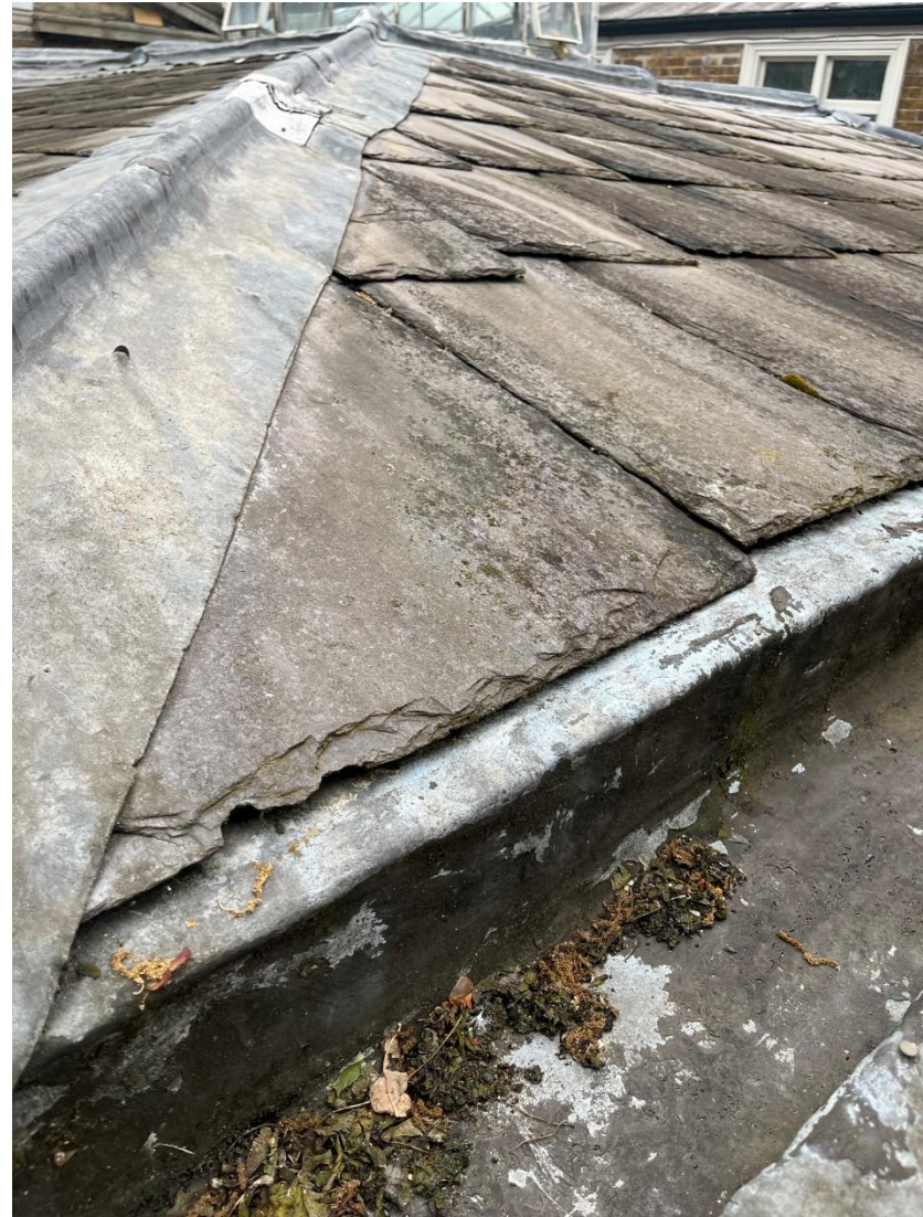
Figure 3: Drama Hall Studio Roof - Externals