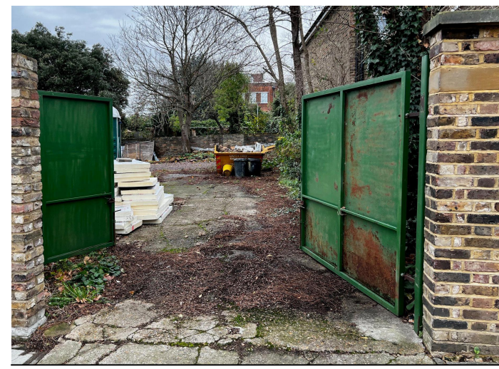
Image of existing metal gates

005 Existing Wall Plan @ 1:50 001 Spring Terrace