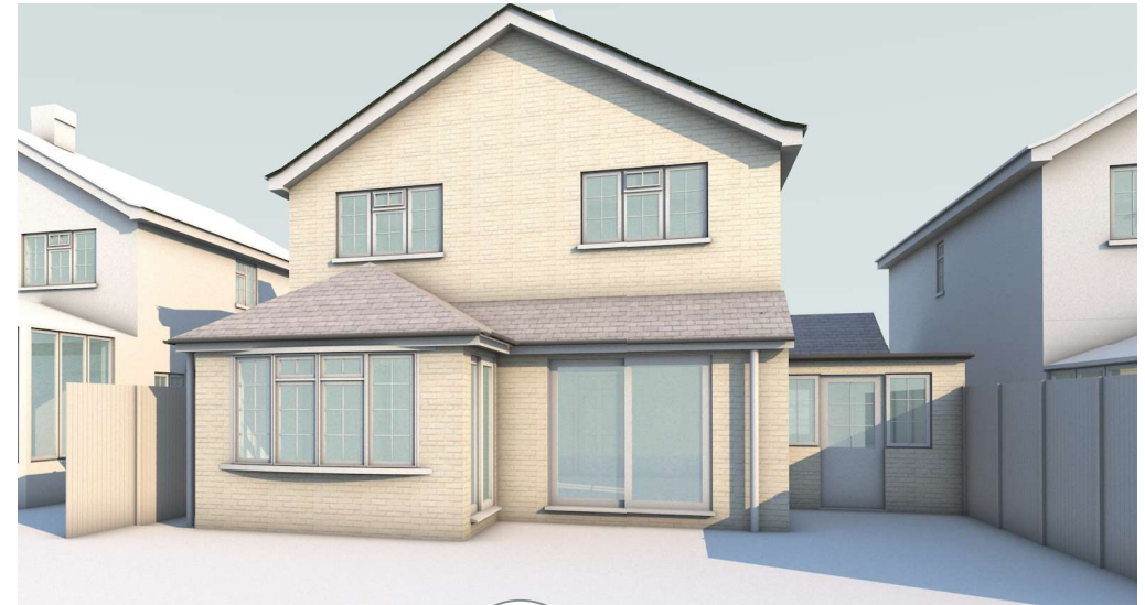
2 3D rear