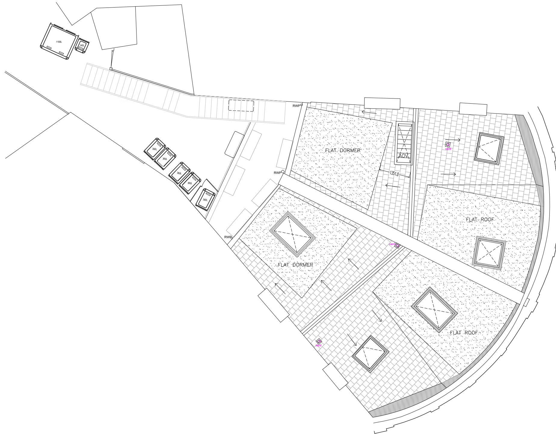
PROPOSED ROOF PLAN