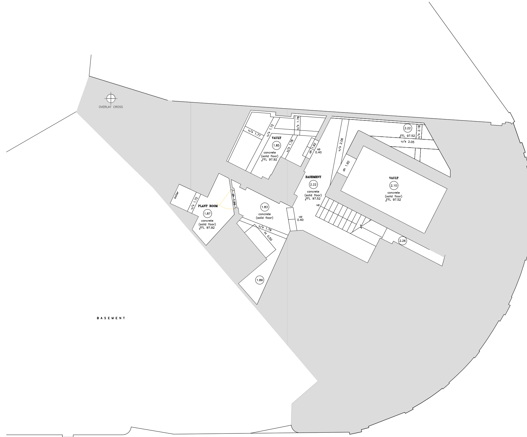
EXISTING BASEMENT PLAN