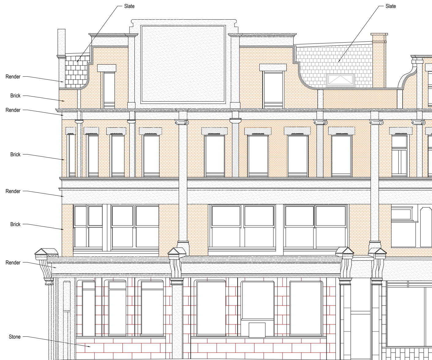
PROPOSED SIDE ELEVATION (RIGHT ELEVATION)