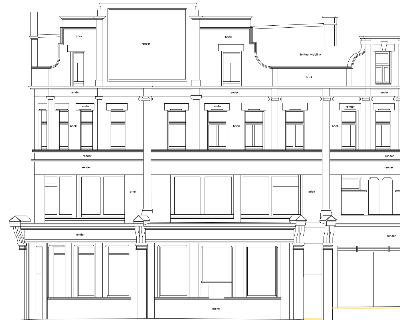
EXISTING FRONT ELEVATION - SOUTHEAST