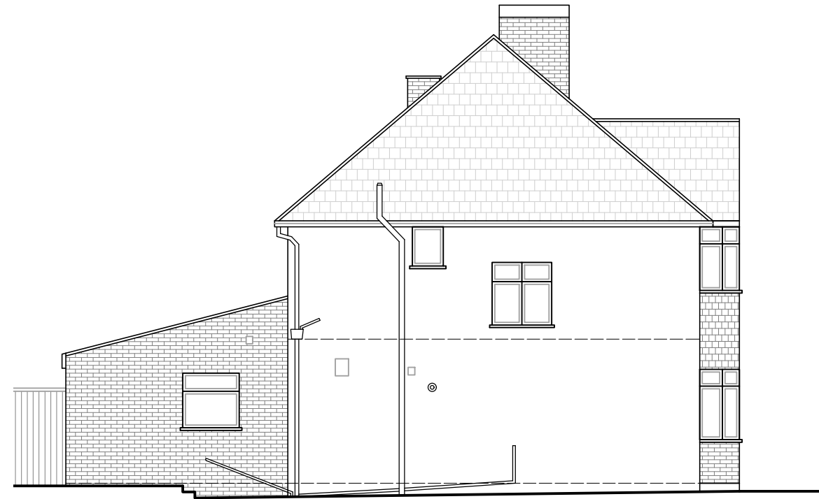
02 Existing Side Elevation E4 1:100 @ A3