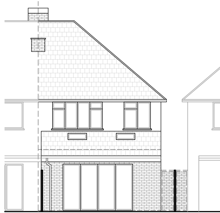
01 Existing Rear Elevation E3 1:100 @ A3