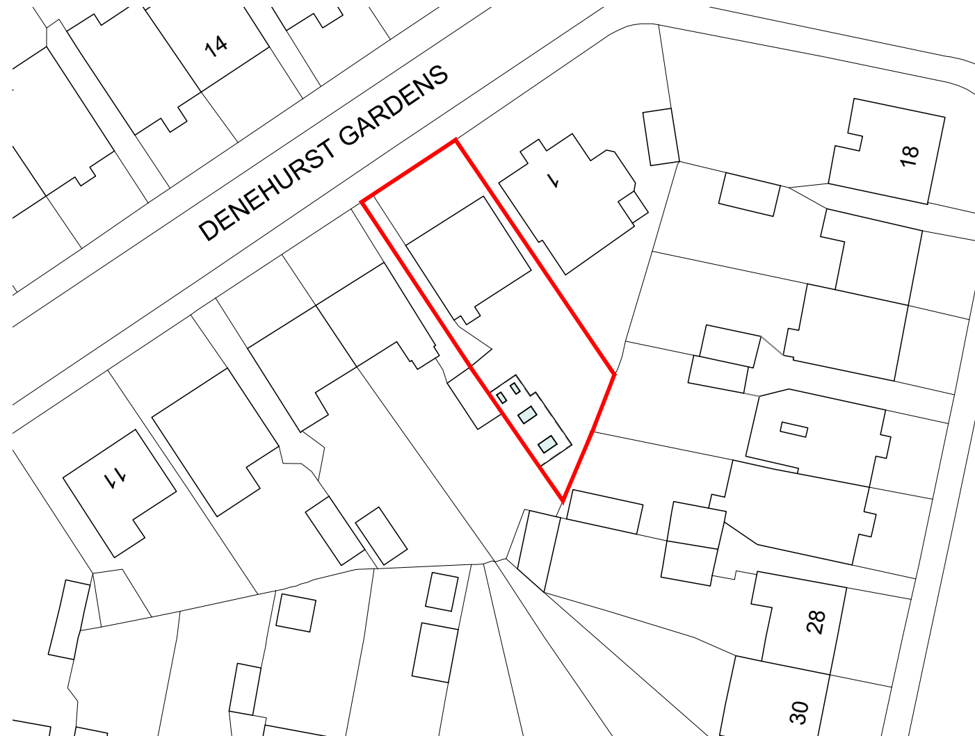
02 Site Plan Scale 1:500 @ A3