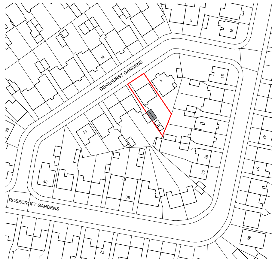
01 Location Plan Scale 1:1250 @ A3