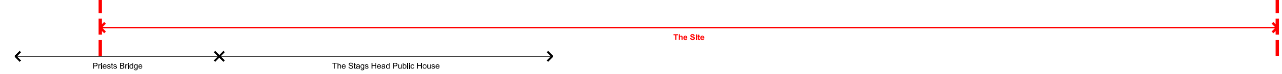
01 - Existing South East Elevation 1:200@A3