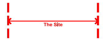
02 - Proposed North East Elevation 1:200@A3