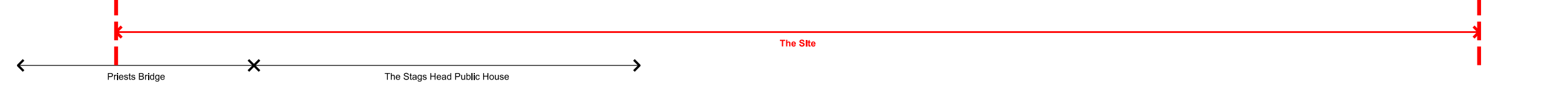
01 - Proposed South East Elevation 1:200@A3