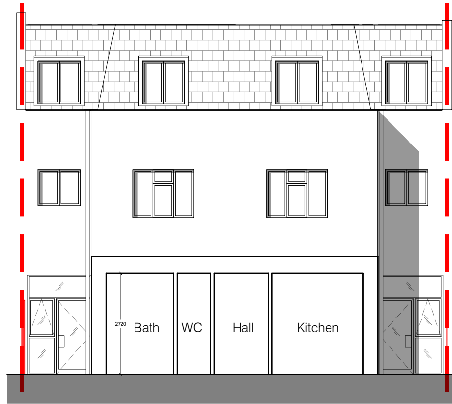
Proposed Section B-B